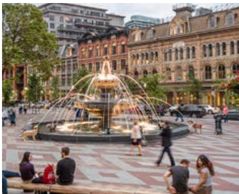
7. Berczy Park, Toronto ON