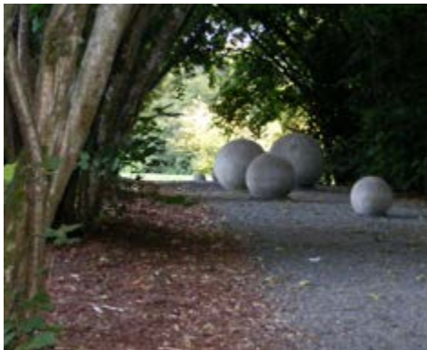
3. "In the Grove"