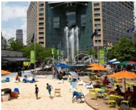
5. Campus Martius, Detroit MI