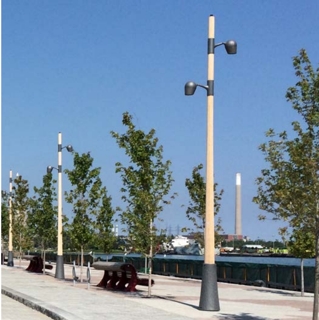
Lighting and benches on Merchants' Wharf Water's Edge Promenade

8. Park Amenities: The design should include a full spectrum of park amenities including benches, lighting, bike racks, drinking fountain, and wayfinding. Consideration should be given to providing playable elements or a modest play feature.