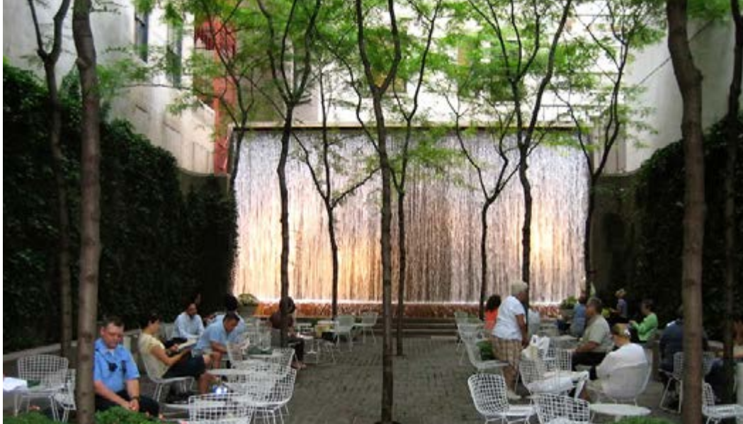
Paley Park, New York, NY