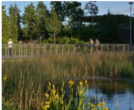
4. Corktown Common, Toronto ON