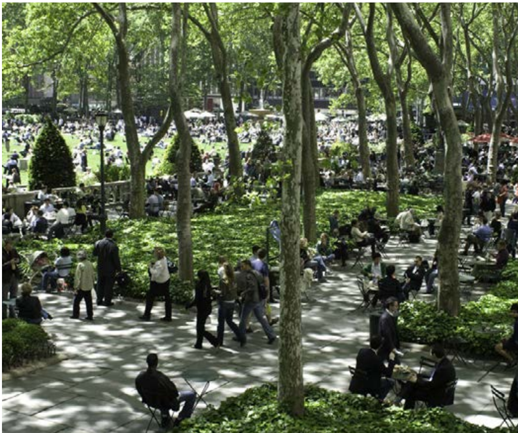
Bryant Park, New York NY

1. Immersive Green: The park should feature a space that is green and peaceful. This experience should be achieved sustainably through horticulture, arboriculture, material choices, and water management. The design must anticipate new forms of use and be robust enough to withstand heavy usage.