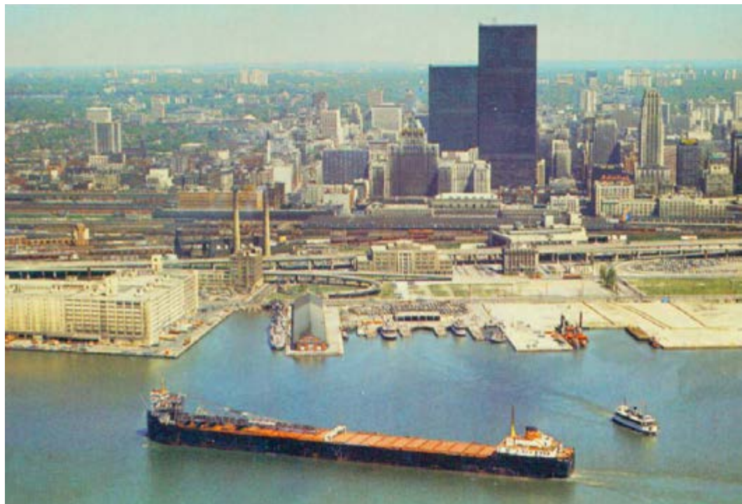
Postcard of the Toronto Waterfront 1970, showing the Off-ramp on the York Street Park site

The winning proposal will proceed into design development, detailed design and construction, for which approximately CAD $7.0 million has been earmarked by the City of Toronto.