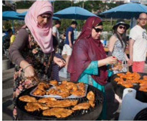
2. Brooklyn Bridge Park, New York NY