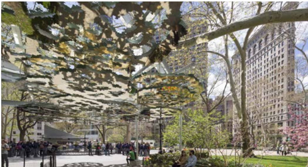
Bryant Park, New York, NY