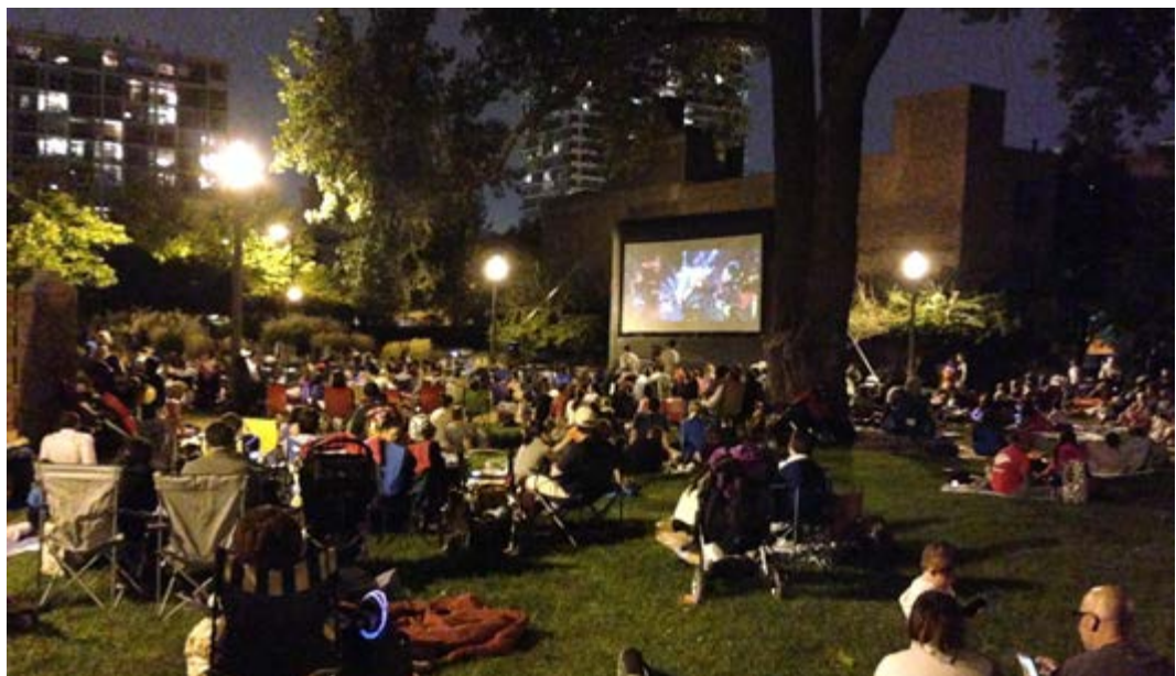
Movies in the Park, Chicago

3. Event Space: The park should be able to transform into a space for larger gatherings, such as movies in the park or civic celebration during special events such as Victoria Day. The event space should be designed to have a minimal impact on surrounding residents,