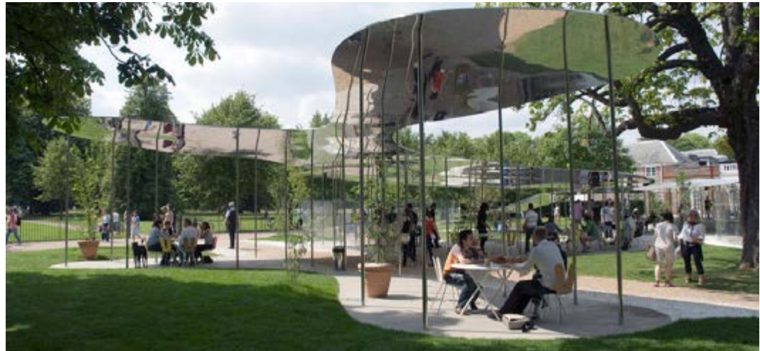
Serpentine Pavilion by SANAA, Kensington Gardens, London UK

6. Architectural Pavilion: York Street Park should include a small pavilion that can accommodate park controls, electrical infrastructure, storage for movable park elements and maintenance tools. The building could include a shaded seating area and a small room with an indoor-outdoor counter that could be used as an information kiosk or other temporary use. Consideration should be given to providing one universal washroom stall.