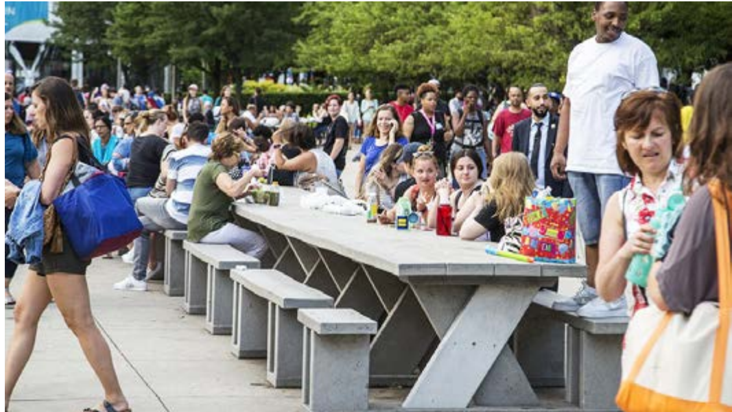
“Running Table”, Millennium Park, Chicago

2. Lunchtime Activity: The park should offer a variety of comfortable places for workers and other visitors to eat alone, in pairs, or in small groups of up to 25 people. The parks should offer these convivial spaces of casual interaction for contemplation, work or meeting that will bring people into the park and separate them from the surrounding city.