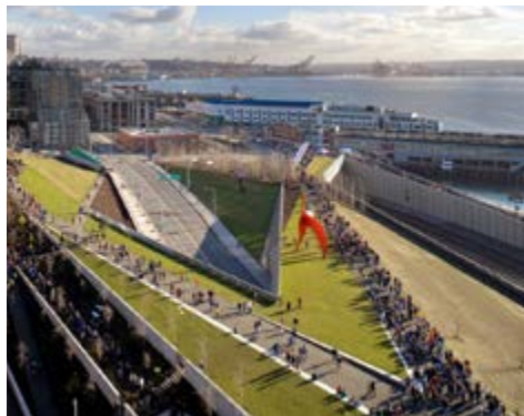
6. Olympic Sculpture Park, Seattle WA