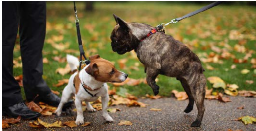
Dogs at the park

7. Accommodation for Dogs: While Parks, Forestry and Recreation has determined that York Street Park does not meet the requirements for the establishment of a Dog Off-Leash Area (DOLA) as described in “People, Dogs and Parks – Off-leash Policy”, there is a high density of dogs in the area. The design for this park should create spaces and places that are accessible for all park users to enjoy. The park design may include innovative design features that accommodate dogs and reduce the impacts of dogs on the park, ensuring that the benefit of the park design is for all users.