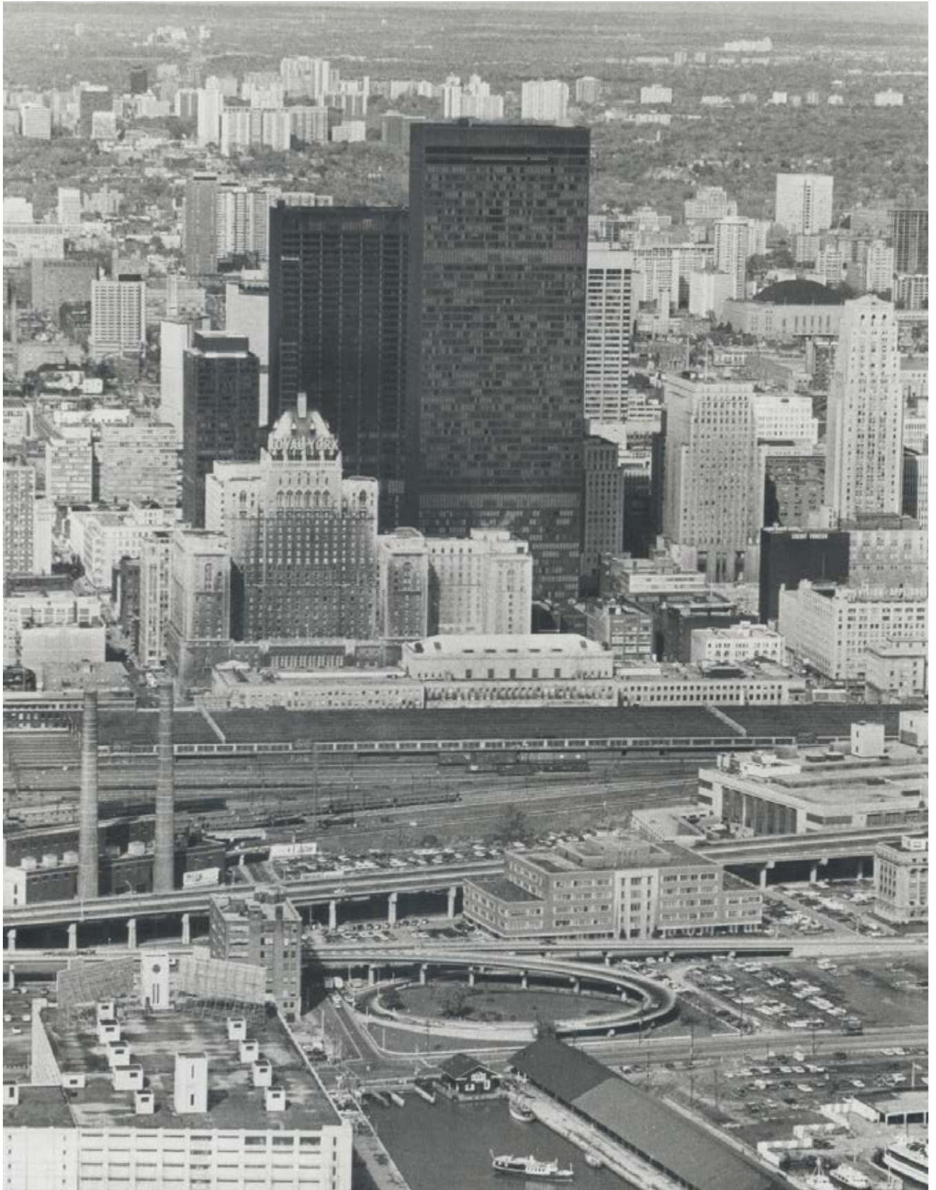
Aerial photo 1969, showing the Off-ramp on the York Street Park site.