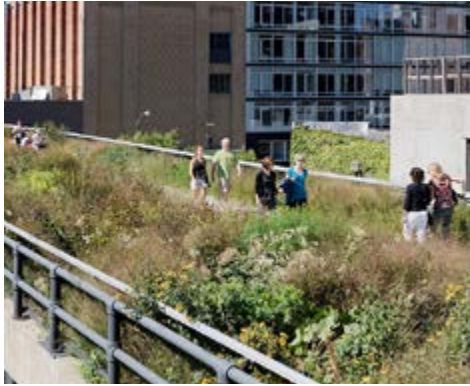
1. High Line, New York NY