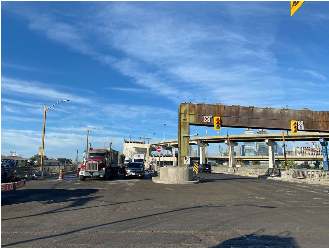
Above: Looking west at Don Roadway, you can see the last remaining steel bent. This bent will be removed as soon as the traffic lights are relocated to a new structure.