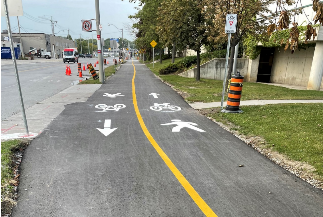
Carlaw Bike Path