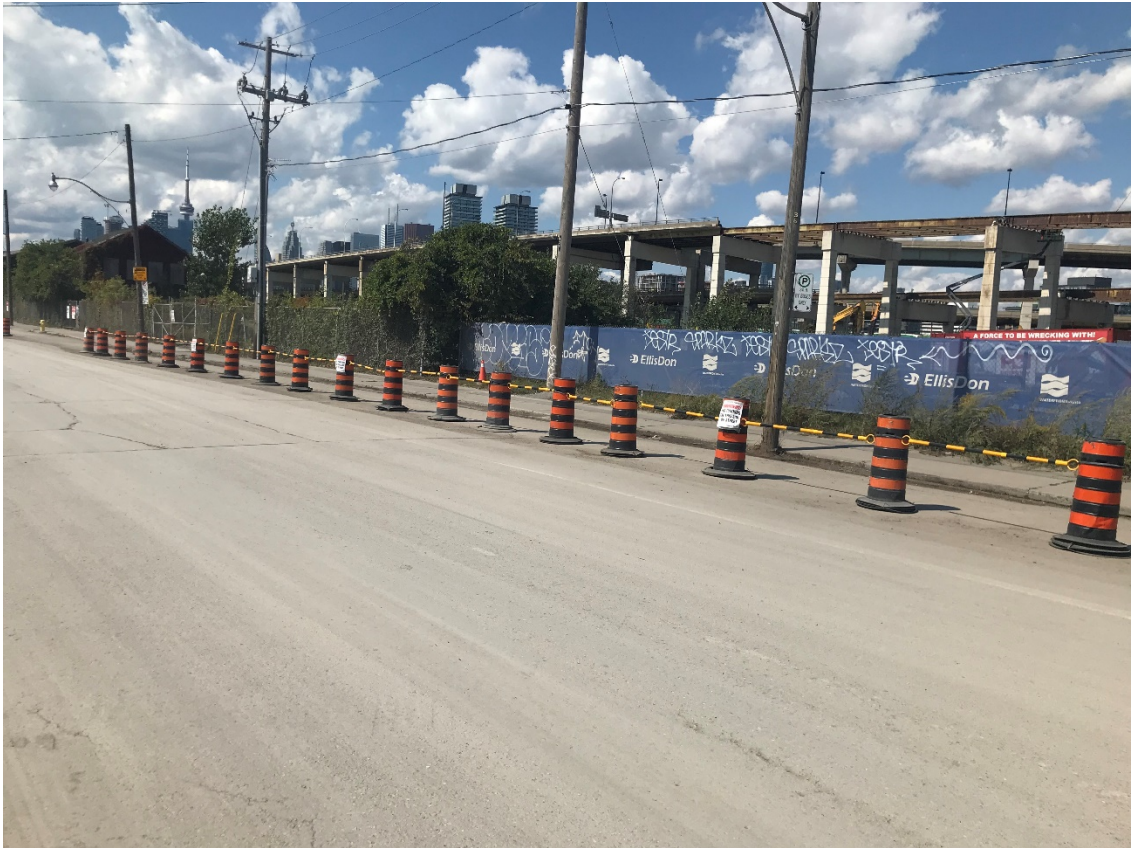
Westbound Villiers Street