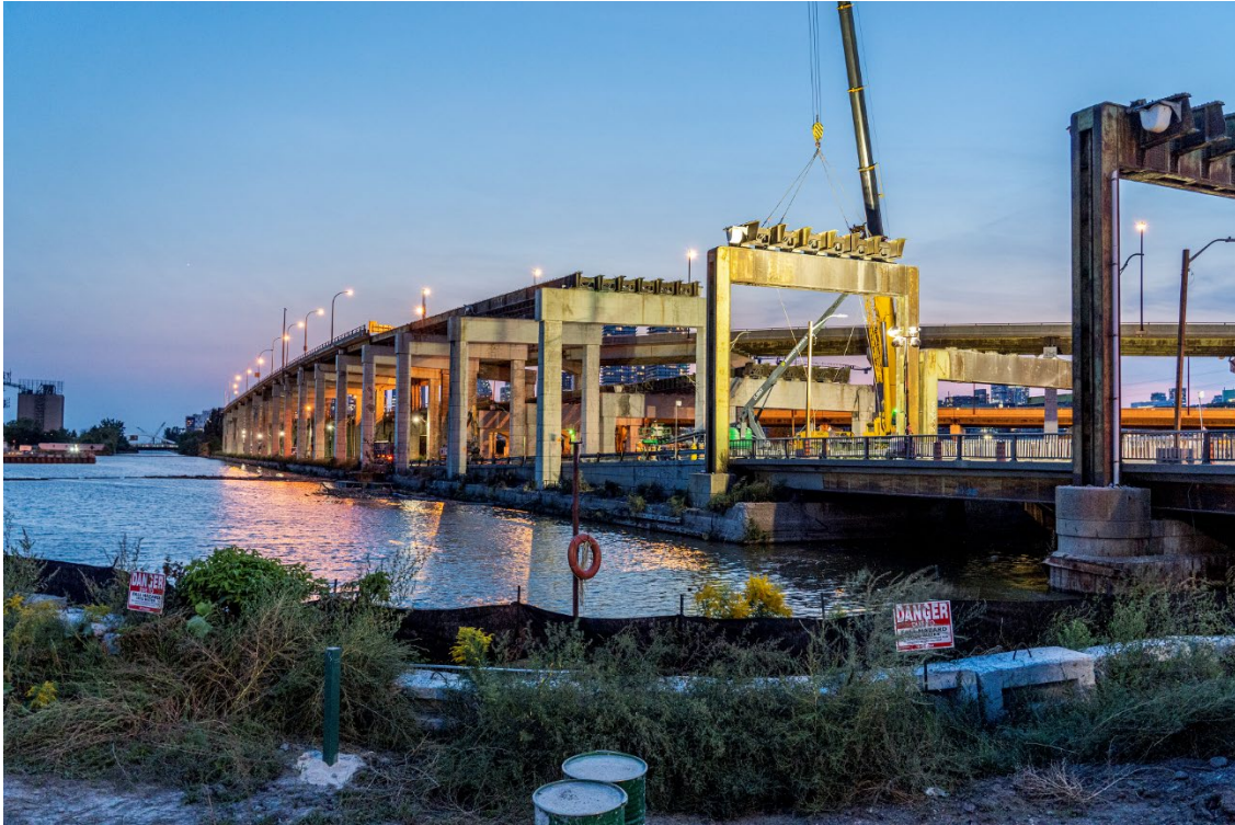
Above: Looking west across the Keating Channel where the roadway has been removed from the Logan Ramps.