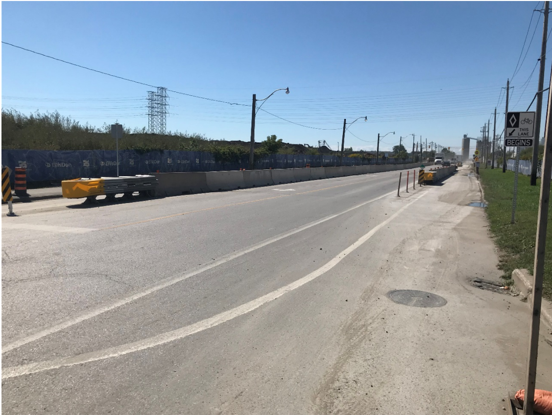
Jersey barriers on the north and south sides of Villiers Street, looking westbound