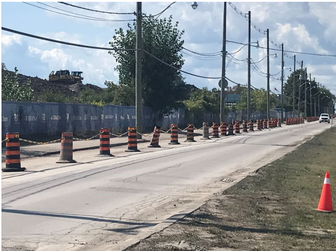
Eastbound Villiers Street