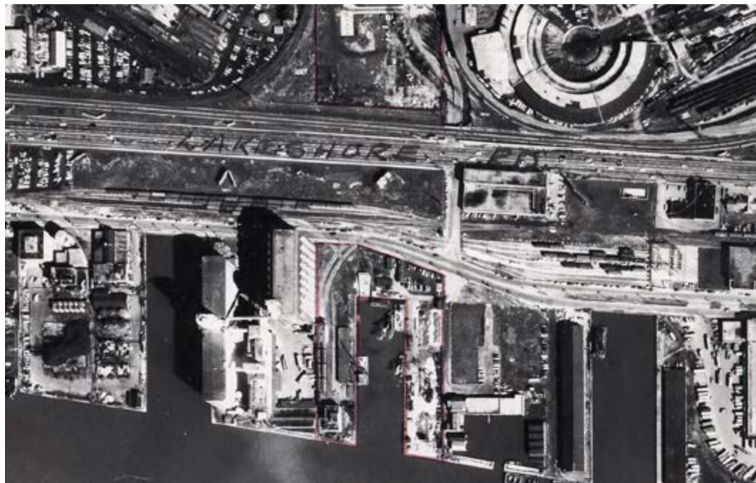
Lake Shore Boulevard and Rees Street aerial, 1960.

The winning proposal will proceed into design development and detailed design. The City of Toronto has earmarked approximately CAD $10 million for the construction of Rees Street Park.