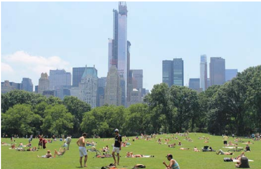
Central Park, New York, NY