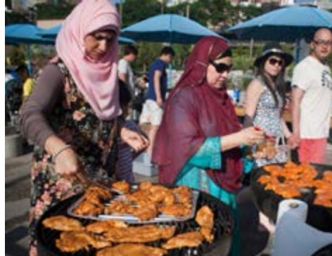
2. Brooklyn Bridge Park, New York NY