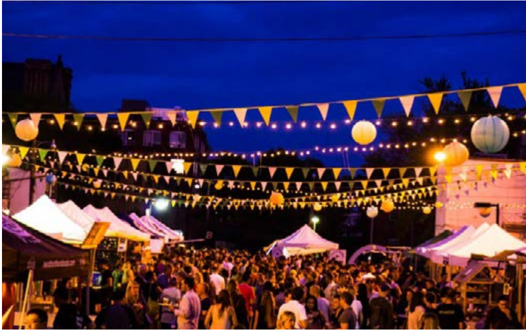
The Stop's Night Market, Toronto ON