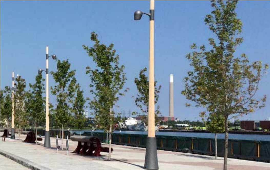
Lighting and benches on Merchants' Wharf Water's Edge Promenade

9. Park Amenities: The design should include a full spectrum of park amenities including benches, lighting, bike racks, drinking fountain, and wayfinding.