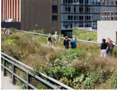
1. High Line, New York NY