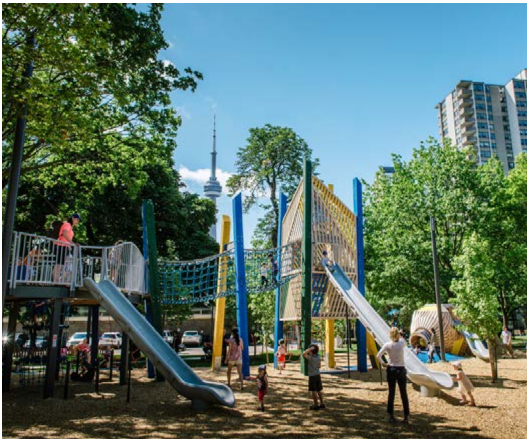
Grange Park, Toronto ON

1. Play for all ages and abilities: This park should include specific features designed for play, for example sports courts, a playground, skateboard features. Beyond dedicated play features, the park should have playfulness and opportunities for fun embedded in all designed aspects. Designers are welcome to propose unique program ideas to create recreational animation.