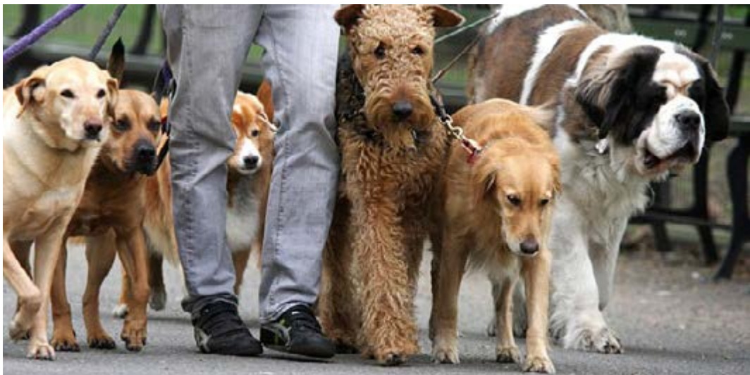
Dogs at the park

7. Accommodation for Dogs: While Parks, Forestry and Recreation has determined that Rees Street Park does not meet the requirements for the establishment of a Dog Off-Leash Area (DOLA) as described in “People, Dogs and Parks – Off-leash Policy”, there is a high density of dogs in the area. The design for this park should create spaces and places that are accessible for all park users to enjoy. The park design may include innovative design features that accommodate dogs and reduce the impacts of dogs on the park, ensuring that the benefit of the park design is for all users.