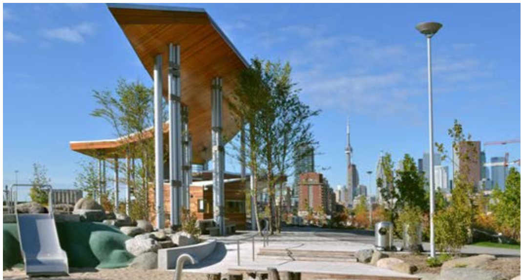
Corktown Common, Toronto ON