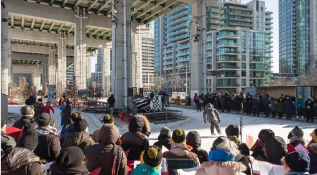
The Bentway Park, Toronto ON

8. Integrate Lake Shore Boulevard and Gardiner Expressway: The design of this park is an opportunity to beckon to pedestrians crossing from the north that it is safe to cross to a comfortable, welcoming waterfront on the south side of Lake Shore Boulevard. The Gardiner Expressway could serve not only as a frame for the site but also as a potential canvas for art/lighting/animation and as shelter from the elements.