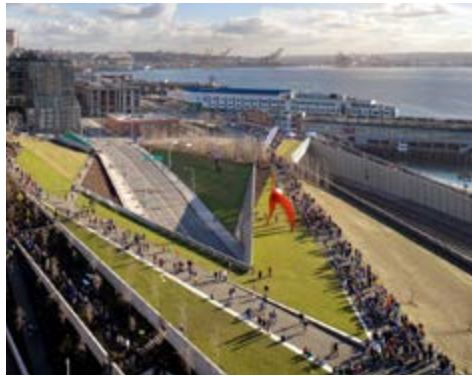
6. Olympic Sculpture Park, Seattle WA