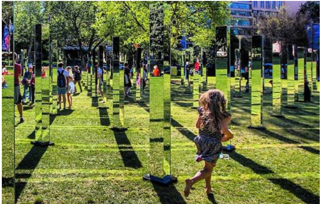
“Out of The Dark, Fiel”, Hyde Park South , Australia

6. Public Art: The design should include a proposal for how public art could be integrated into the park.