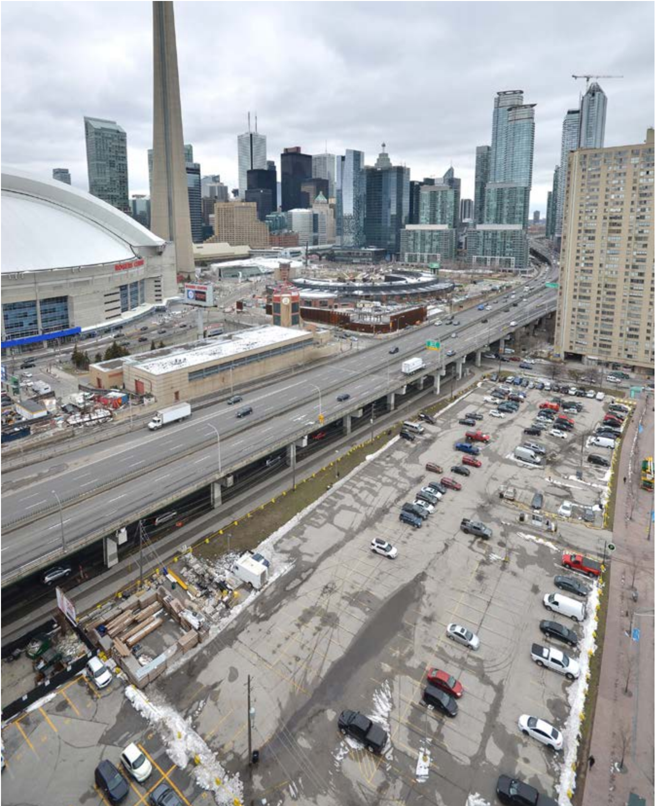
Rees Street Park, April 2018