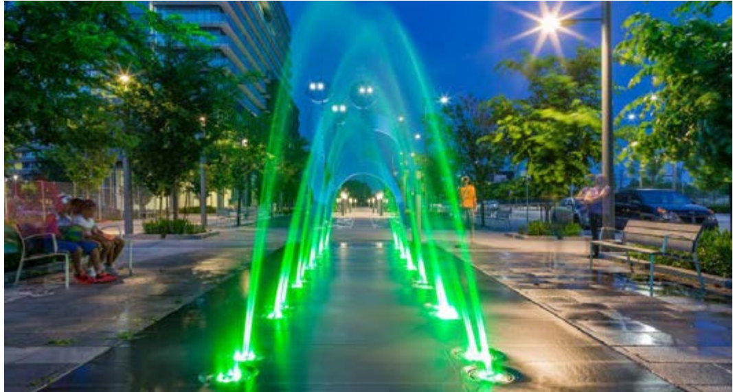
Front Street Promenade, West Don Lands, Toronto ON