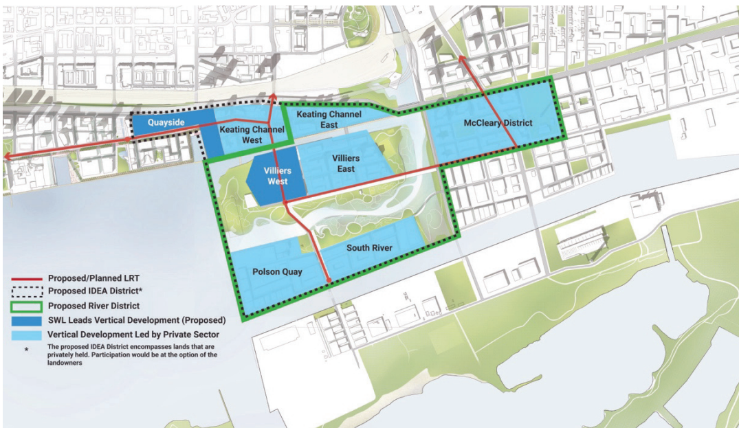
Map of Quayside, the River District, and the IDEA District

It is available at www.QuaysideTO.ca and at all of the locations where a hard copy of the MIDP is provided (see bottom of previous page for a list of locations).