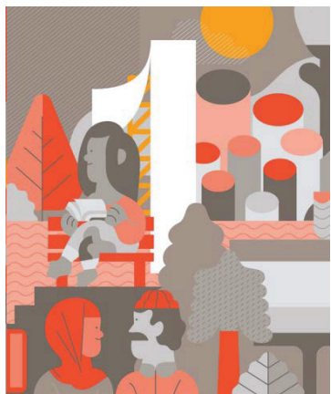
Volume 1: The Plans

The Master Innovation and Development Plan proposed by Sidewalk Labs is organized into three Volumes. In the broadest terms, Volumes 1 and 2 propose plans for development and innovation (mostly things that we can see and touch). In Volume 3, Sidewalk Labs describes what they think is required to make those plans happen. There is also a fourth Overview document.