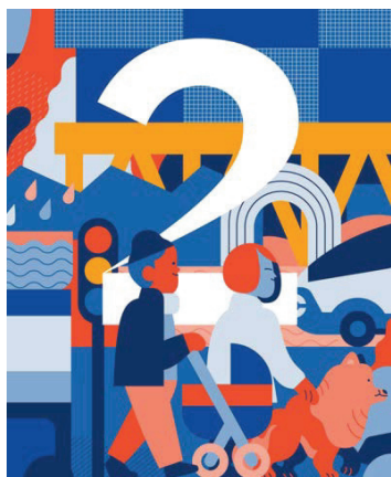
Volume 2: The Urban Innovations