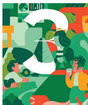
Volume 3: The Partnership