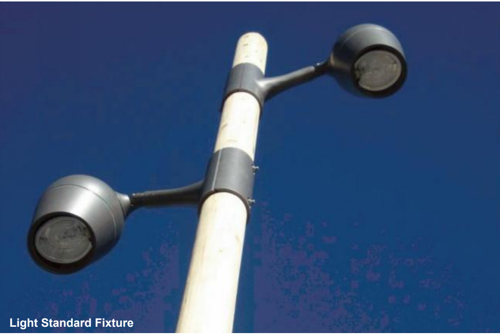
Light Standard Fixture