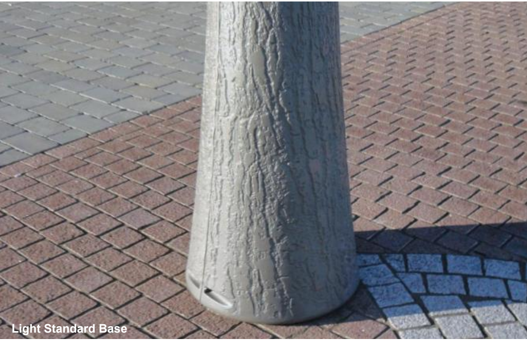
Light Standard Base