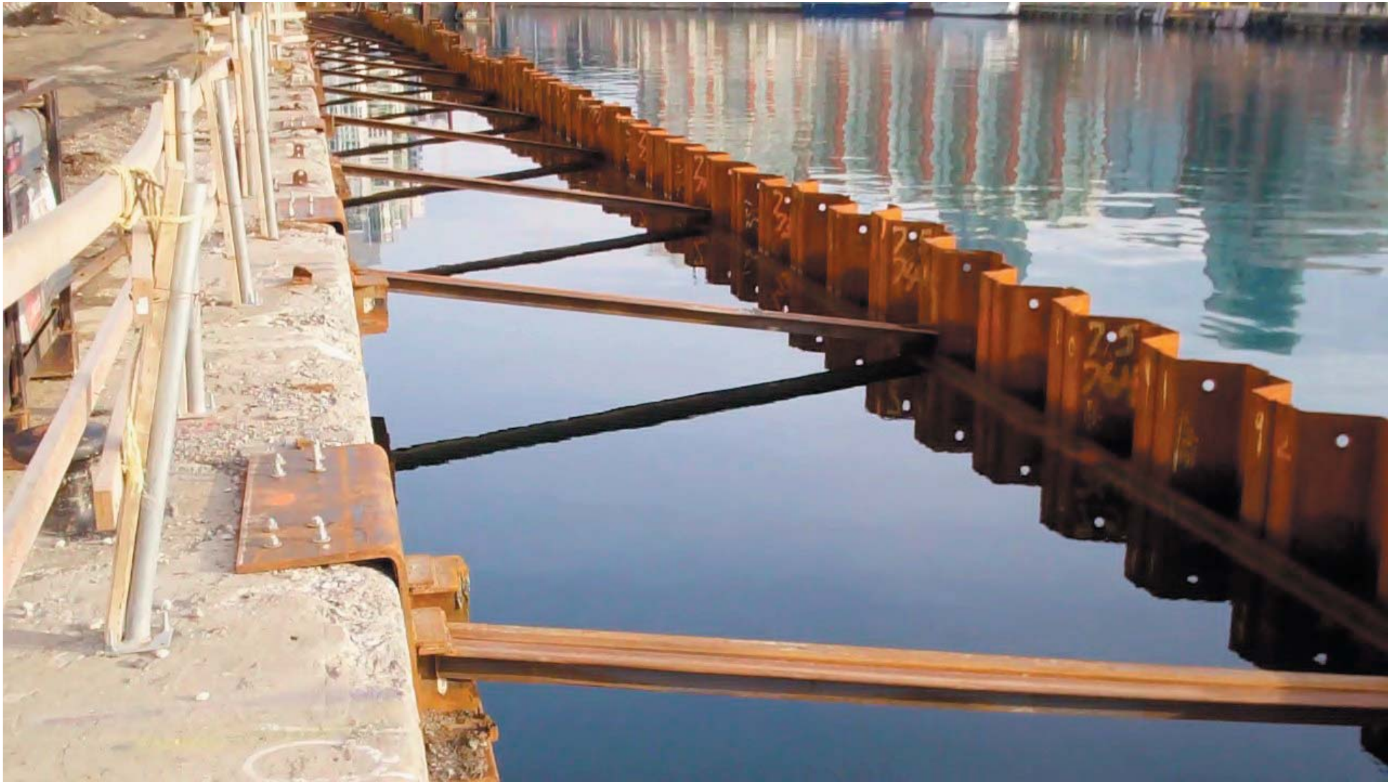
New dockwall sheet piling installed.