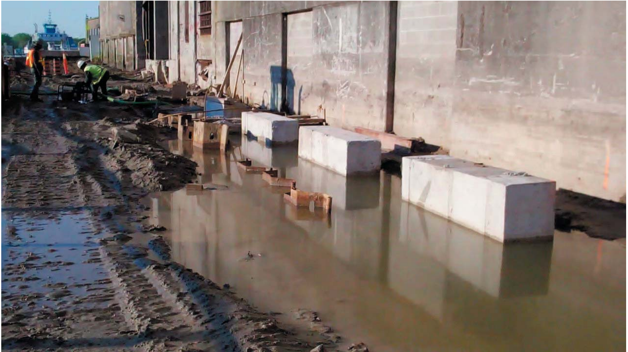
Installation of anchor blocks.