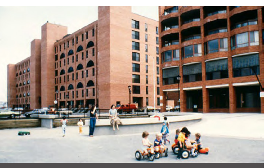
St. Lawrence Neighbourhood, a phased developed from the mid 1970s, is an example of one of Toronto's first complete communities.

Within a Port Lands context, delivering inclusive communities will be achieved by ensuring the