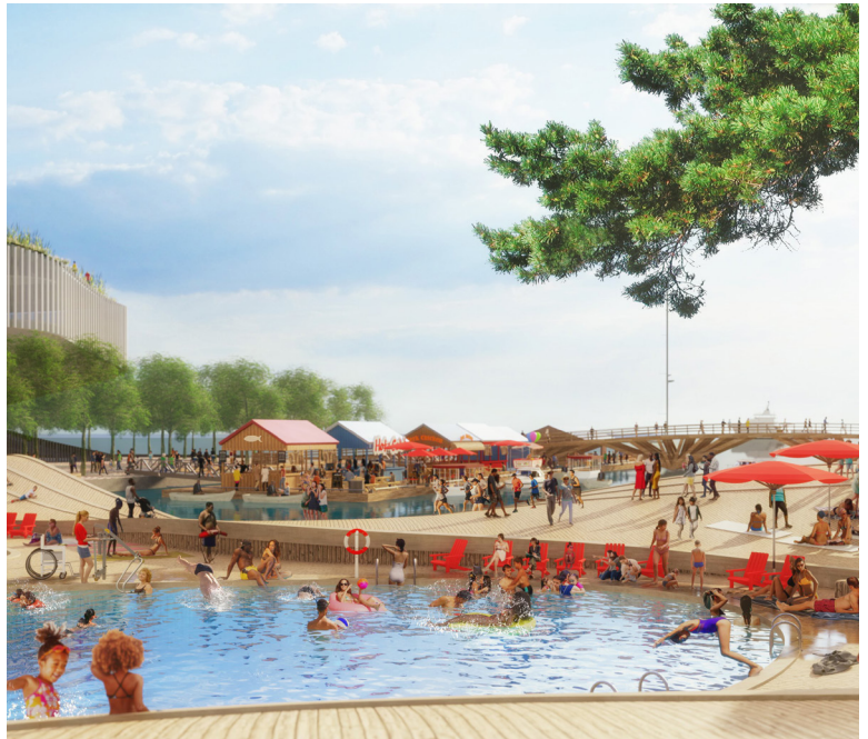
View looking north from the Inner Harbour (left) and view looking south from Queens Quay East (right). The proposed vision for the Parliament Slip would create a more active and inclusive waterfront for everyone to enjoy, attracting tourism and providing a much-needed amenity for local residents.

The Parliament Slip has potential to become a world class, public destination for swimming, kayaking, boating, entertainment, and dining never seen in Canada before. Located at the foot of historic Parliament Street along Queens Quay East, the Parliament Slip offers remarkable views of the lake and is only a skipping stone's throw from the emerging Villiers Island and future Promontory Park.