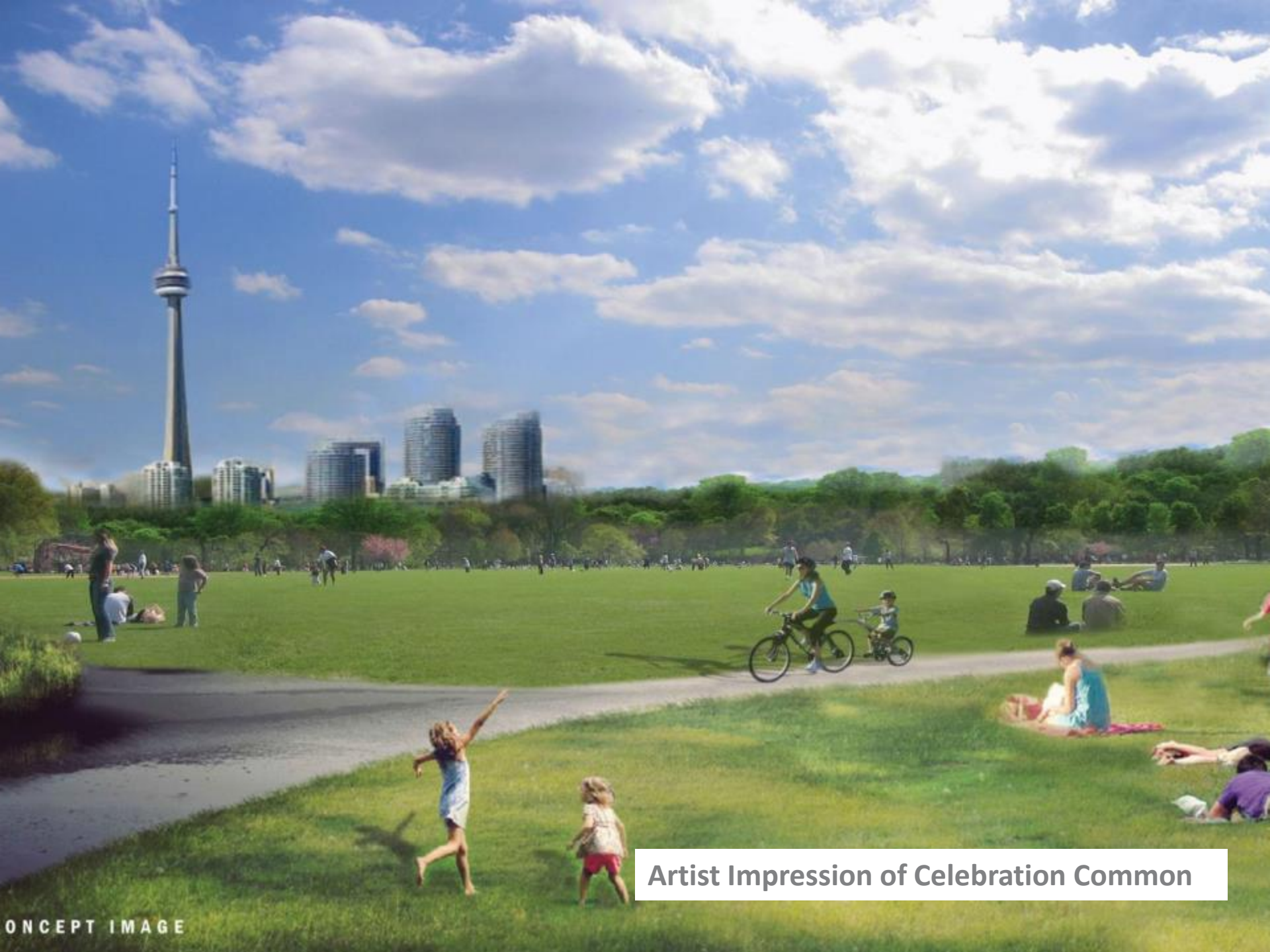
Artist Impression of Celebration Common