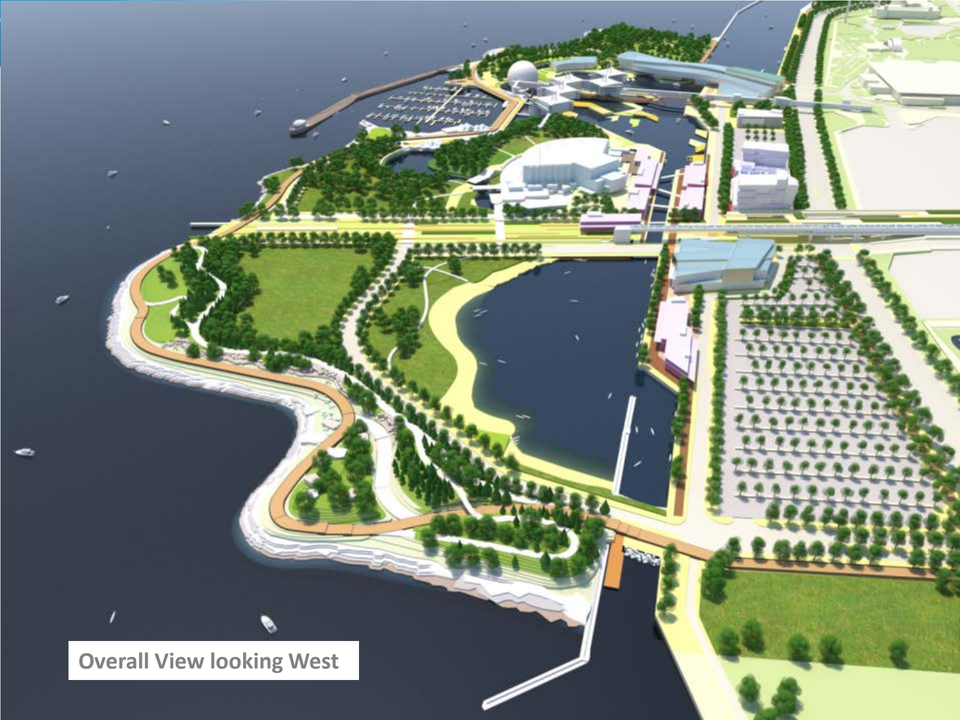
Overall View looking West