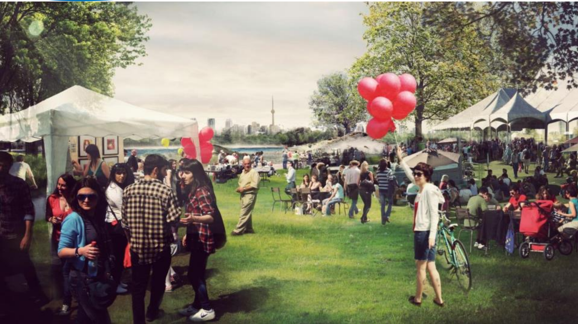
Artist Impression of Celebration Common