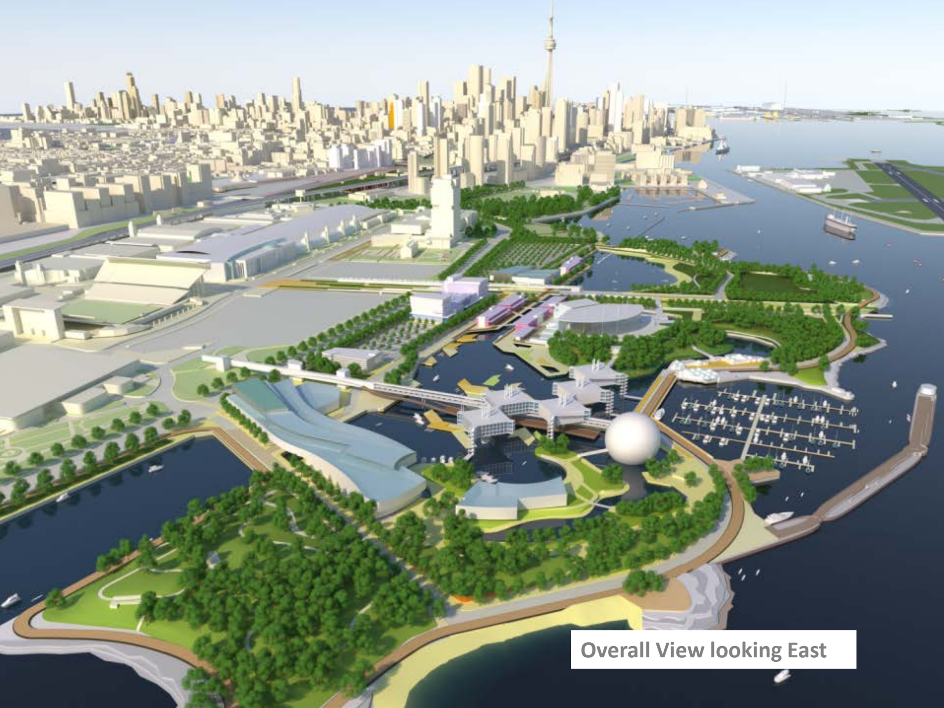
Overall View looking East