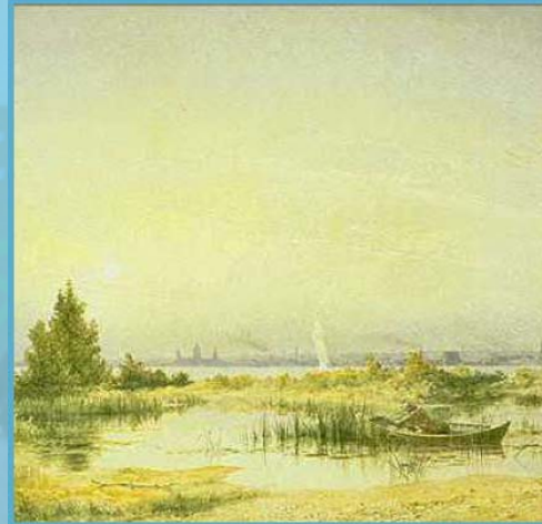
Over 2 Centuries Ago

By the 1800s, many people had moved to the Town of York to live and work in the area and the City of Toronto was officially born. The wetlands and marshes surrounding the Don River were filled in so industries and factories could be built to supply the people of Toronto with coal, textiles, and furniture.