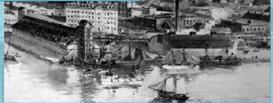
Mid 1800's to Mid 1900's