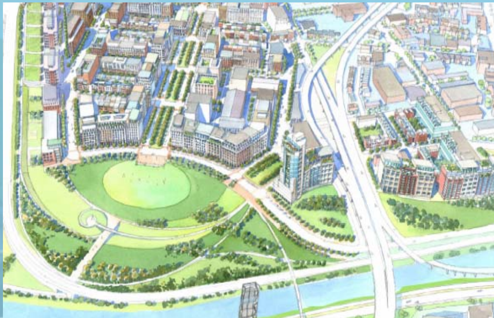
West Don Lands Concept