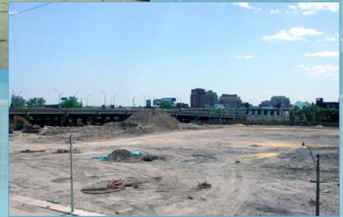
The Site Today