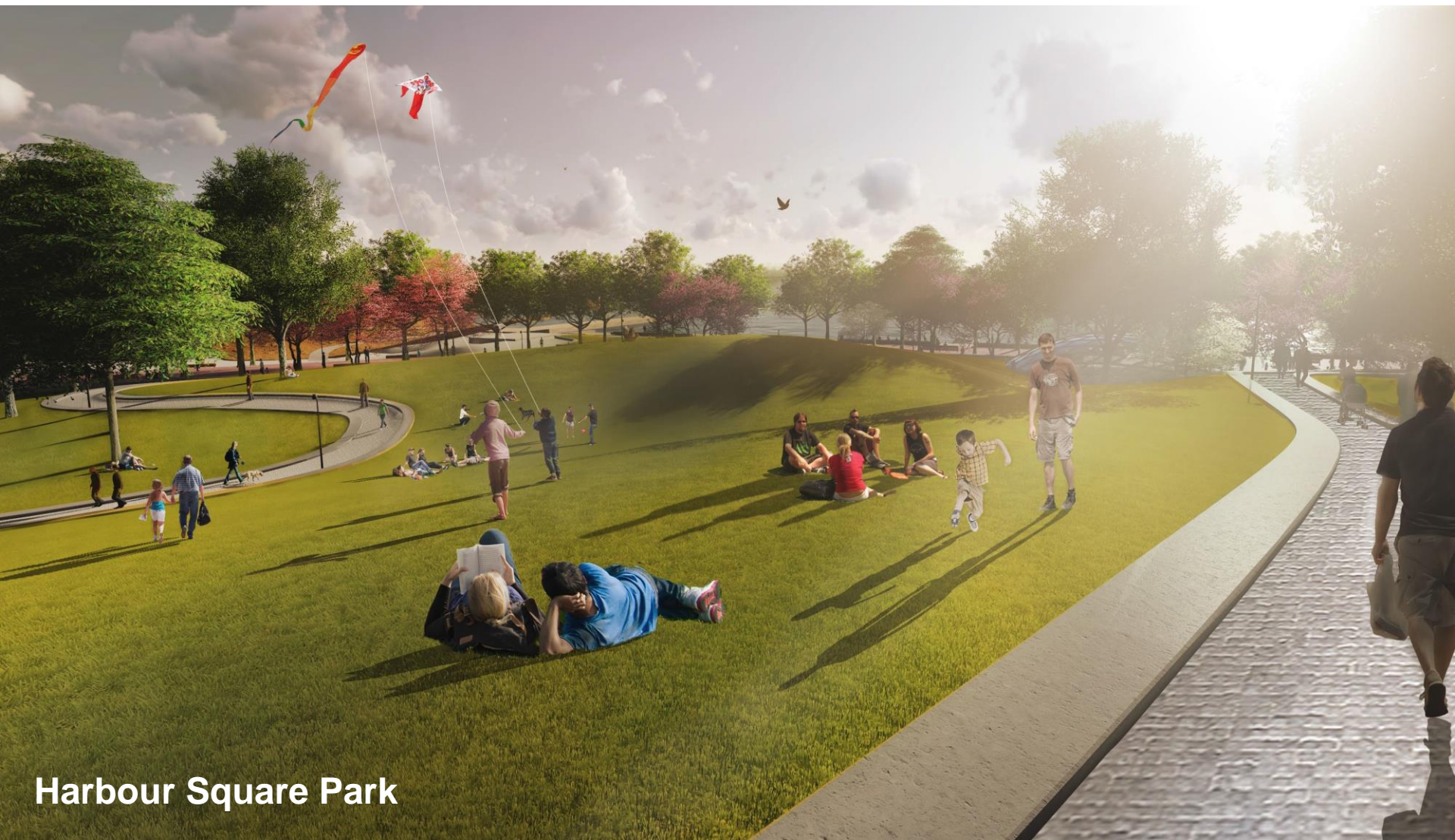
Harbour Square Park