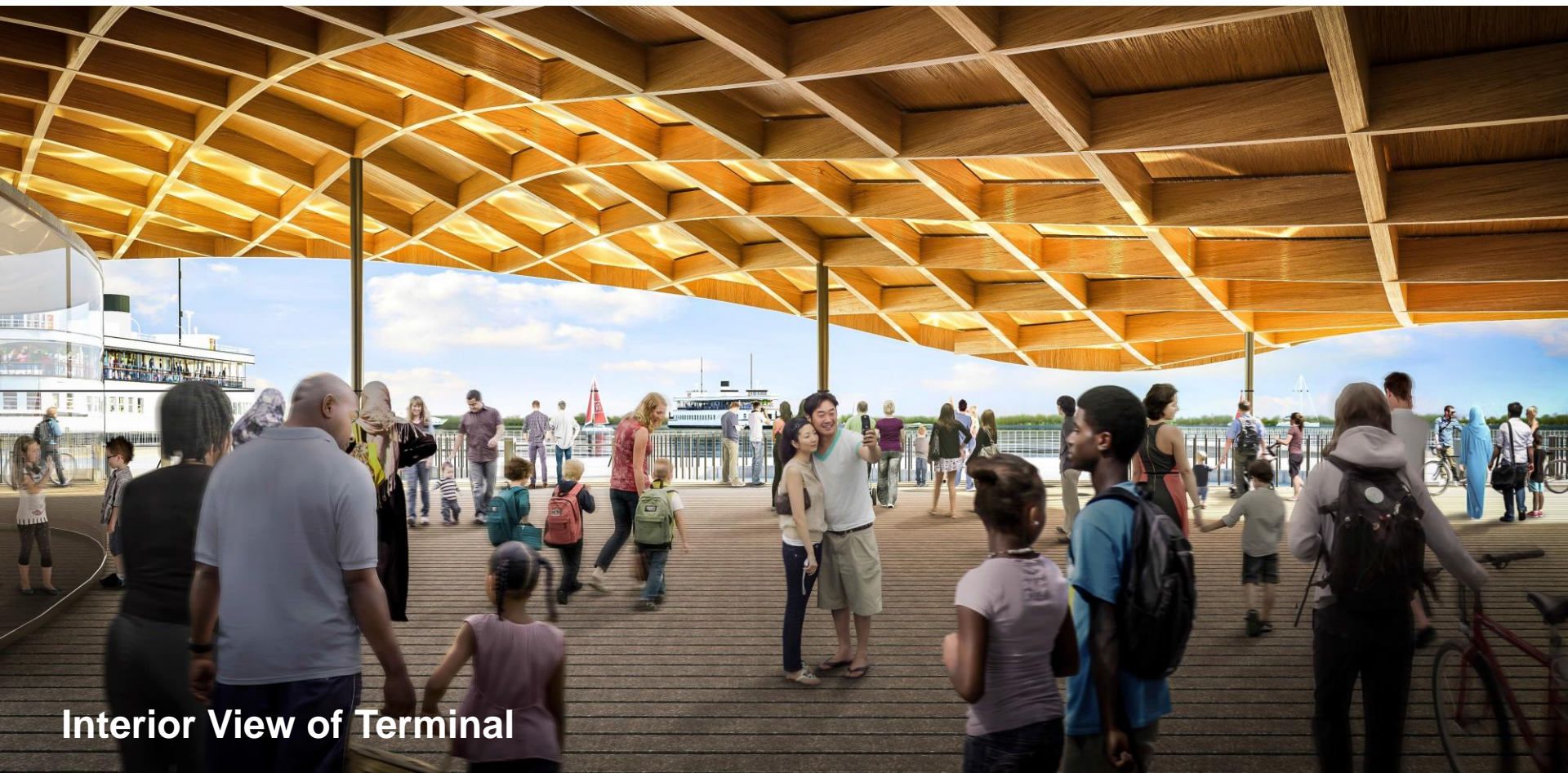
Interior View of Terminal