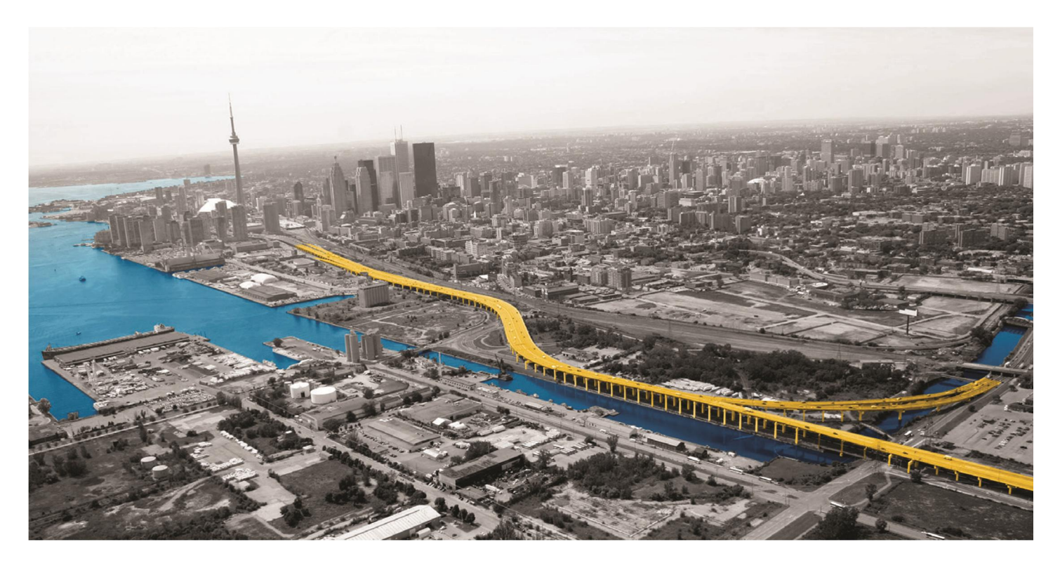
Gardiner Expressway and Lake Shore Boulevard East Reconfiguration