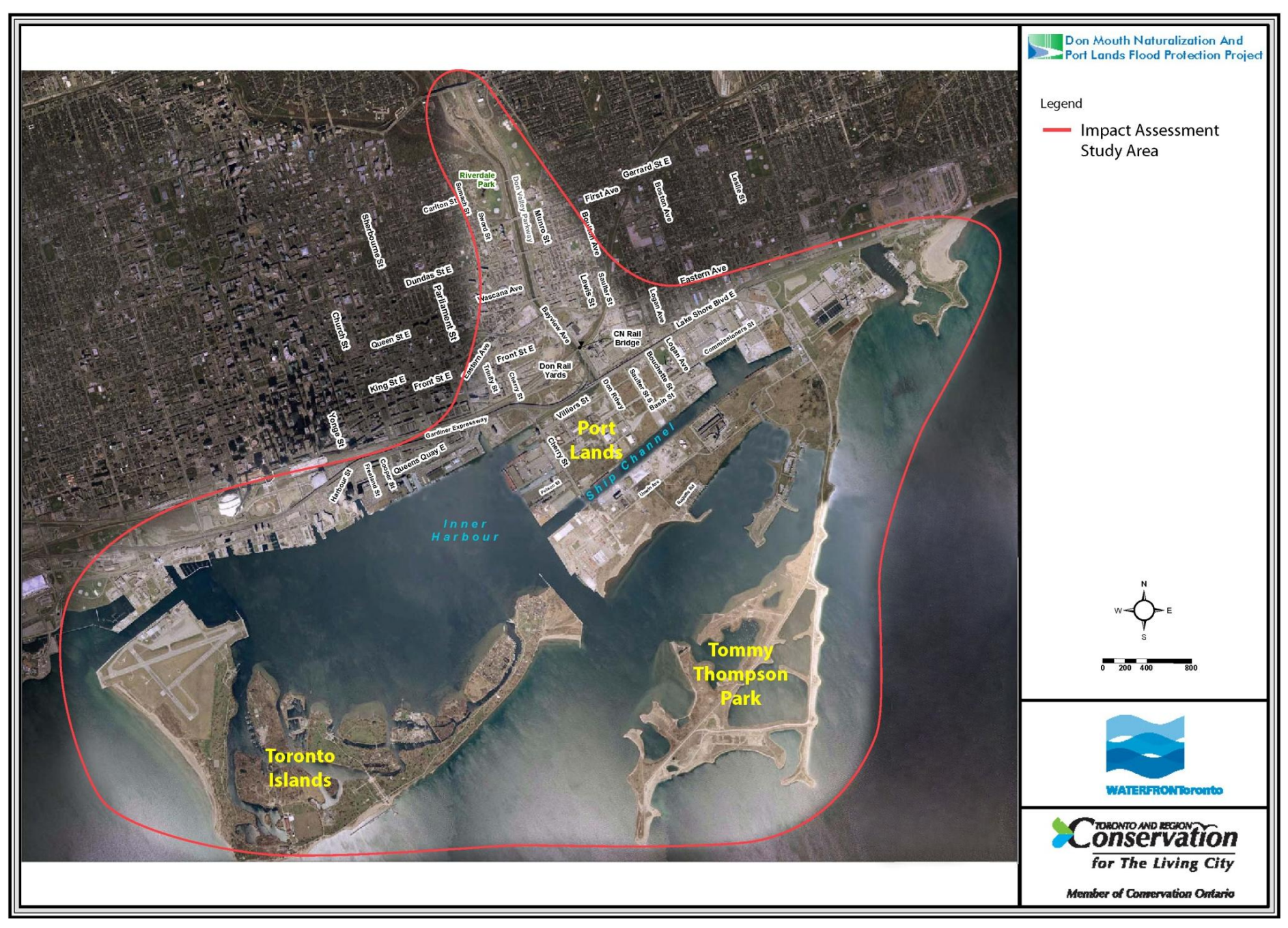
Figure E-2. Impact Assessment Study Area