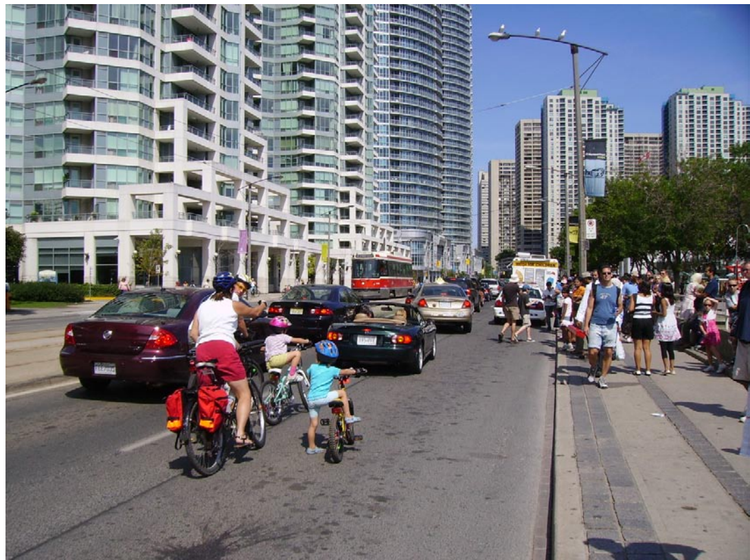
Queens Quay Existing Condition

The problem statement for the EA was developed over a five-month period. It was based on several past efforts—the Innovative Design Competition, Quay to the City pilot, Queens Quay Traffic Feasibility Study, as well as established City and Waterfront Toronto policies and guidelines. It was refined through considerable input and collaboration with the public. Two Stakeholder Advisory Committee meetings and one public forum were dedicated to build consensus among the study team and stakeholders with the problem statement.