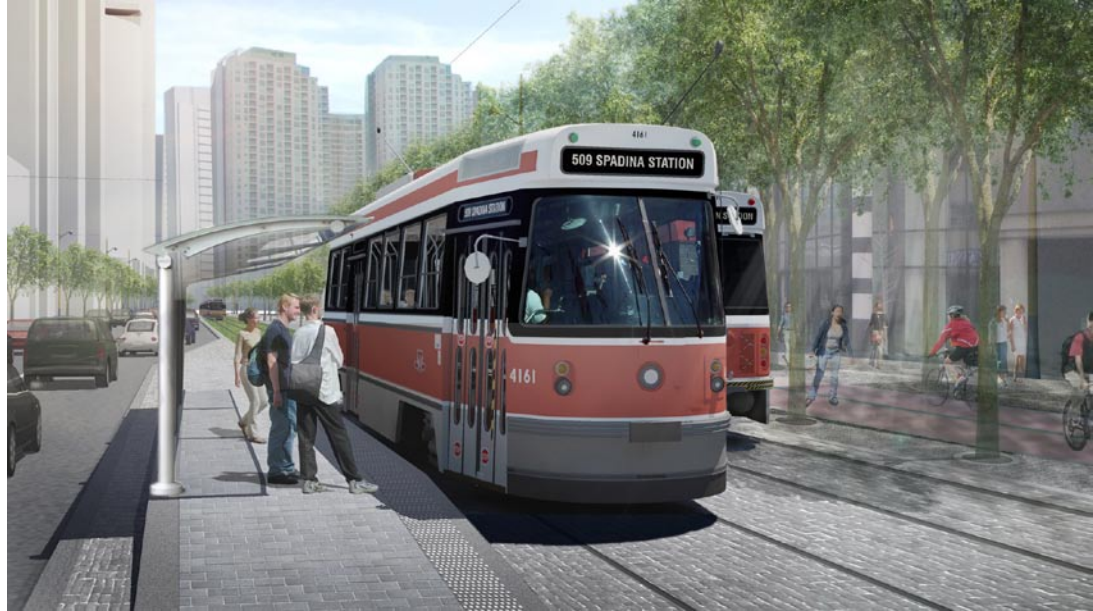
Proposed expanded and accessible TTC Platforms

The pedestrian boulevards on both sides of the street will vary in width, simply due to inconsistencies in the right-of-way dimension. In the existing built-up segment, Queens Quay varies from 21 to 30.5 metres. Generally, the north curb (and thus the pedestrian boulevard) will remain in its existing location with local adjustments where required. The south pedestrian boulevard will be quite generous. The preferred alternative considers pedestrian-accessible spaces along the streets in weather-protected colonnades and arcades as part of the boulevard. This is a similar strategy used in Toronto and many European cities to expand the pedestrian portions of the street. The TTC right-of-way itself affords an opportunity to further improve the quality and character of the public realm. Currently the track bed is poured in place concrete. Future materials could include unit pavers or reinforced turf to accommodate vehicle access. In either case, the right-of-way could be of higher quality materials than what is typically designated in Toronto.