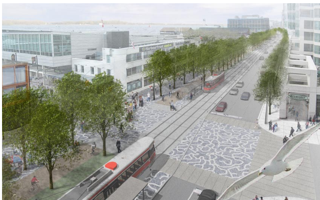
Winning entry for the 2006 Central Waterfront Innovative Design Competition highlighting the transformation of Queens Quay into a world class boulevard