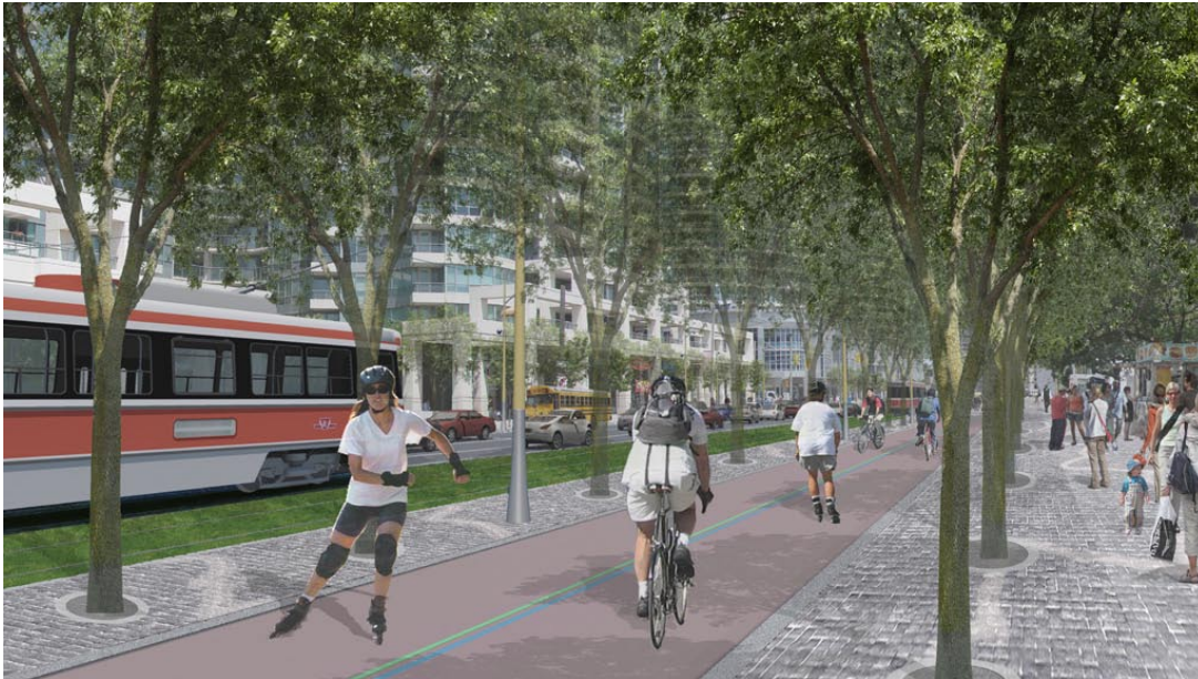
The Martin Goodman Trail to the south of the TTC right-of-way within a double row of trees