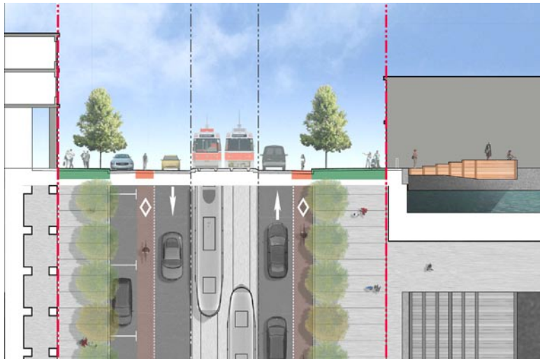
Figure E-2: The Three Shortlisted Alternative Design Concepts

Alternative 2: Centre Transit with On Street Bike Lanes Maintain Existing Conditions add dedicated on-street bike lanes