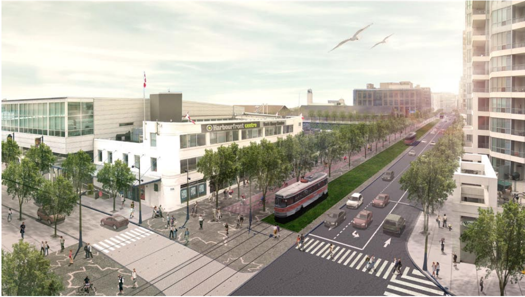
The Preferred Plan for Queens Quay Revitalization: Southside Transit with Expanded Public Realm and Two-Way Operations