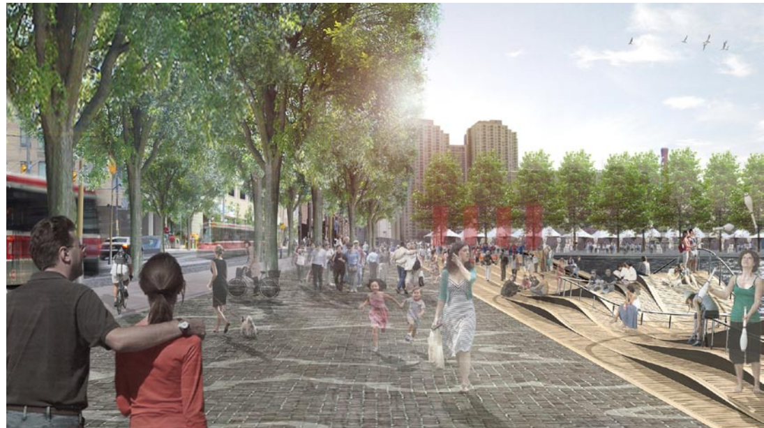
The Preferred Plan for Queens Quay Revitalization: Southside Transit with Expanded Public Realm and Two-Way Operations