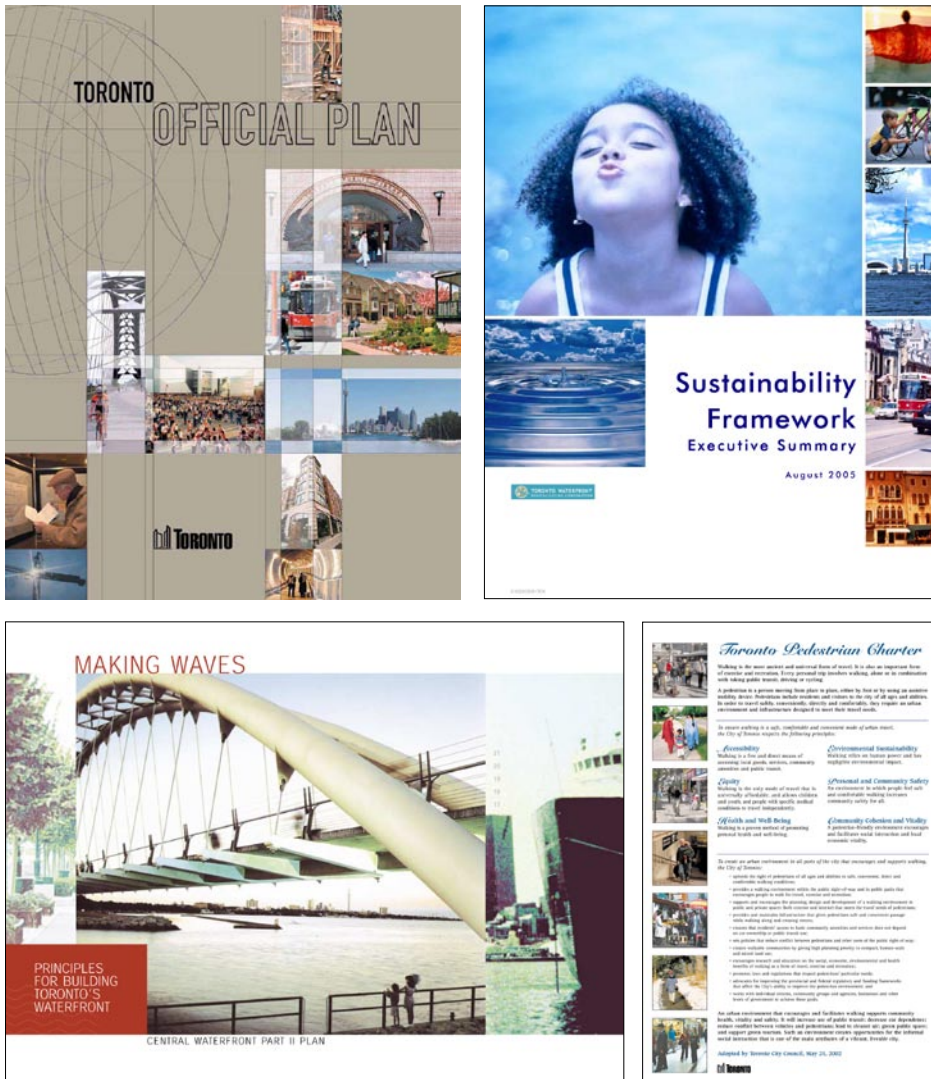
Direction for the Revitalization of Queens Quay is found in several Policy documents

A thorough review of City of Toronto Official Plan policies specific to this project is found in Chapters 6 and 7 of the complete Environmental Study Report.