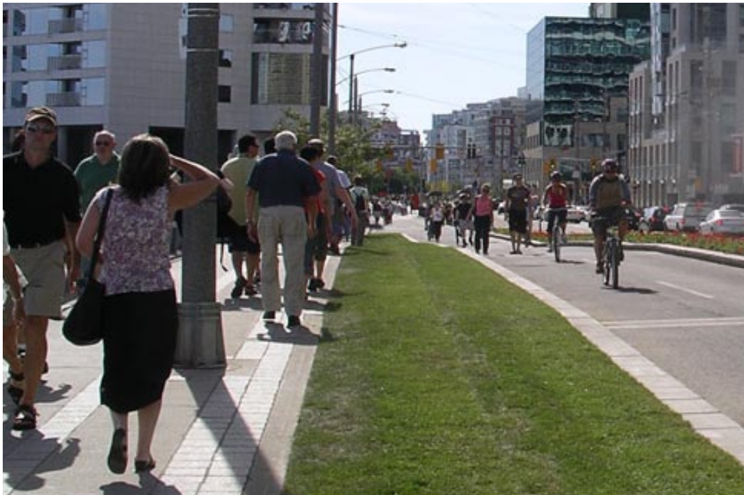
Quay to The City pilot project

Key observations of the pilot were: the street reconfiguration supported an overwhelming increase in pedestrian and cyclist activity; Queens Quay westbound saw an initial peak in traffic during the first couple of days. After one week, the volumes settled to typical levels; Lake Shore Boulevard eastbound saw an increase in traffic volumes. This increase was distributed throughout the day and not confined to the peak hours.