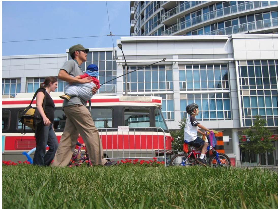
Quay to the City Pilot Project

Consultation for the Queens Quay EA built on earlier efforts as part of the Central Waterfront Design process, including those carried out as part of the design competition and the “Quay to the City” pilot project.