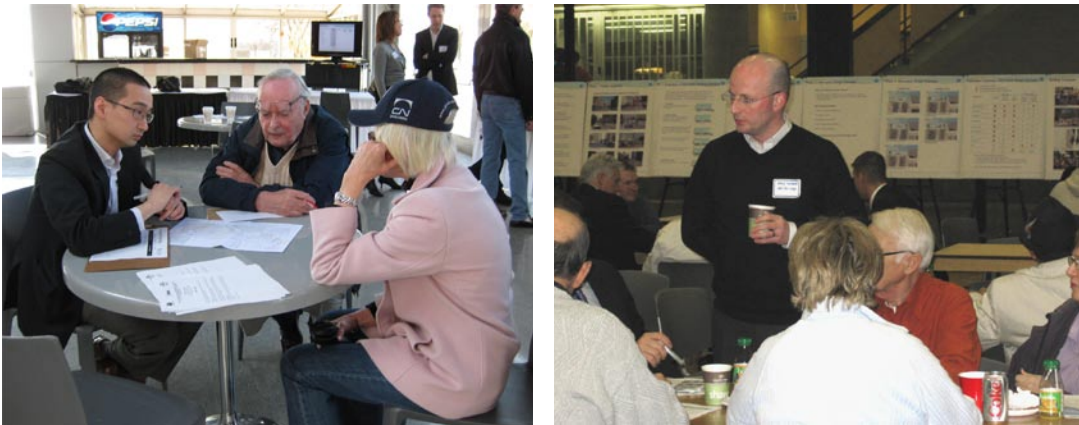
Three Public Forums and one Open House were part of the consultation process

Three Public Forums and one Open House were held at accessible meeting locations within the EA study area. Each of the meetings was well attended, with at least 200 participants at each. Worksheets ensured each participant had the opportunity to record his or her ideas and opinions. These worksheets were collected and documented in the meeting reports, which were posted on the Waterfront Toronto website for review following the meetings. Throughout the EA process, Waterfront Toronto continued to receive and document questions, concerns and suggestions from stakeholders and members of the public.