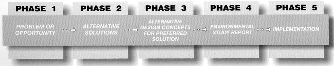
Figure 2 – The Class EA Process

The five phases of the Class EA process are summarized as follows: