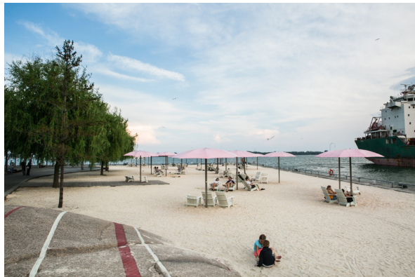
Sugar Beach, TORONTO