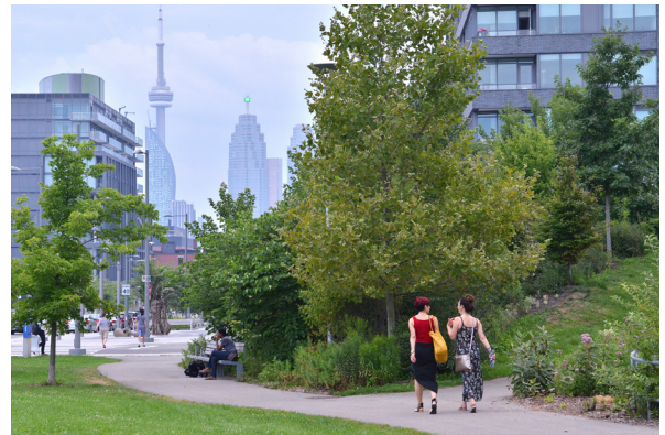
West Don Lands, TORONTO

For more information on Waterfront Toronto, please visit www.waterfronttoronto.ca