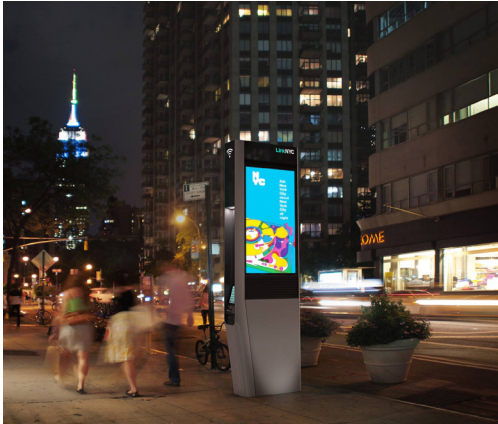
Link NYC, NYC