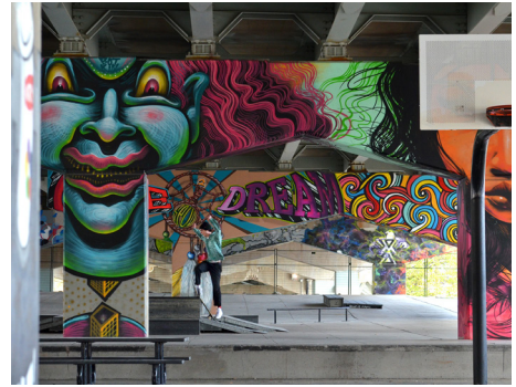
Underpass Park, TORONTO

Waterfront Toronto was established in 2001 by the Government of Canada, Province of Ontario, and the City of Toronto to unlock the social and economic potential of the waterfront by using best practices in urban revitalization.