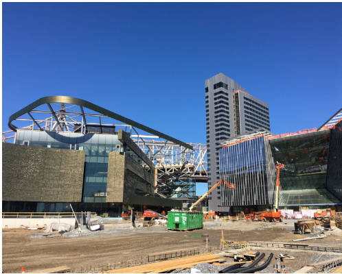
Cornell Tech, NYC