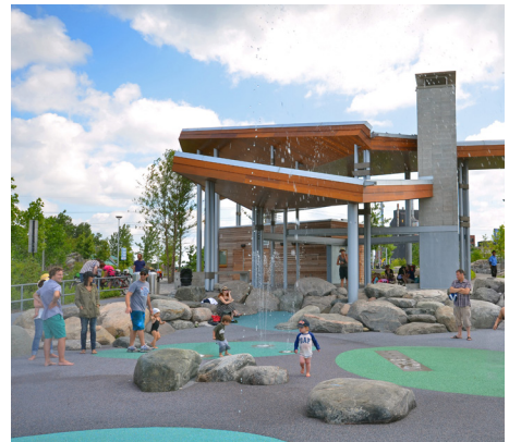
Corktown Common, TORONTO