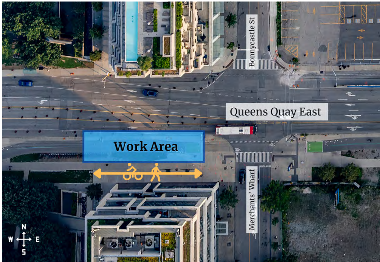
Above: Aerial view indicating the work area on Queens Quay East at Merchants' Wharf, where underground civil electrical work will temporarily narrow the trail and sidewalk