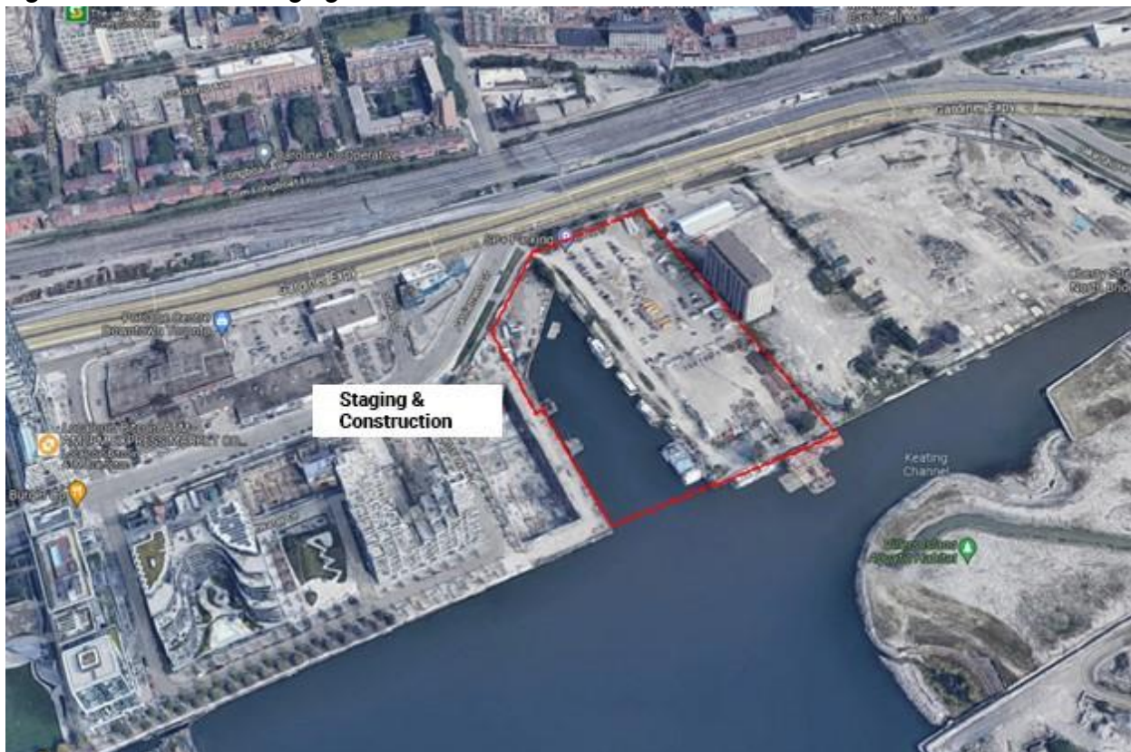
Figure 1: Location of staging and construction

Area within and surrounding the Parliament Slip spanning from just east of Merchants' Wharf to 333 Lake Shore Boulevard East and south to the waterfront.