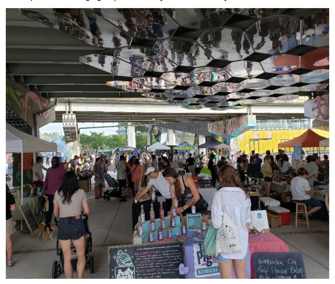
Underpass Park Farmers Market