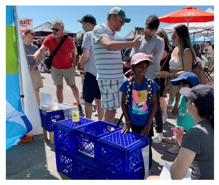
Smorgasburg Open Air Market