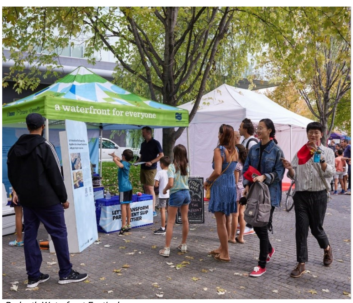
Redpath Waterfront Festival