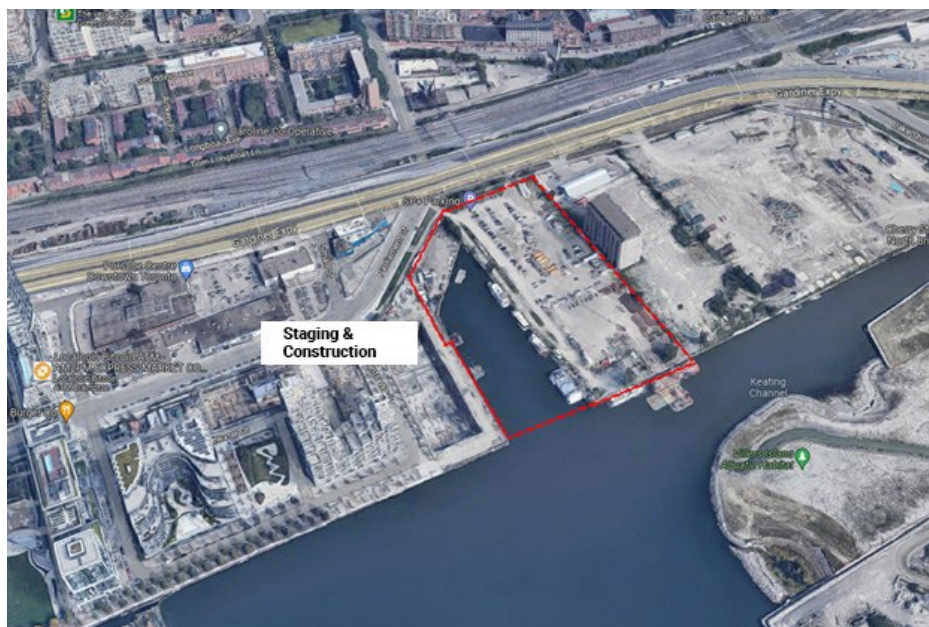
Figure 1: Location of staging and construction

Area within and surrounding the Parliament Slip spanning from just east of Merchants' Wharf to 333 Lake Shore Boulevard East and south to the waterfront.