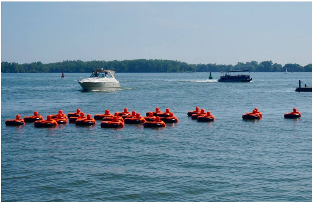
A+J Art+Design SOS ( Safety Orange Swimmers ), 2019