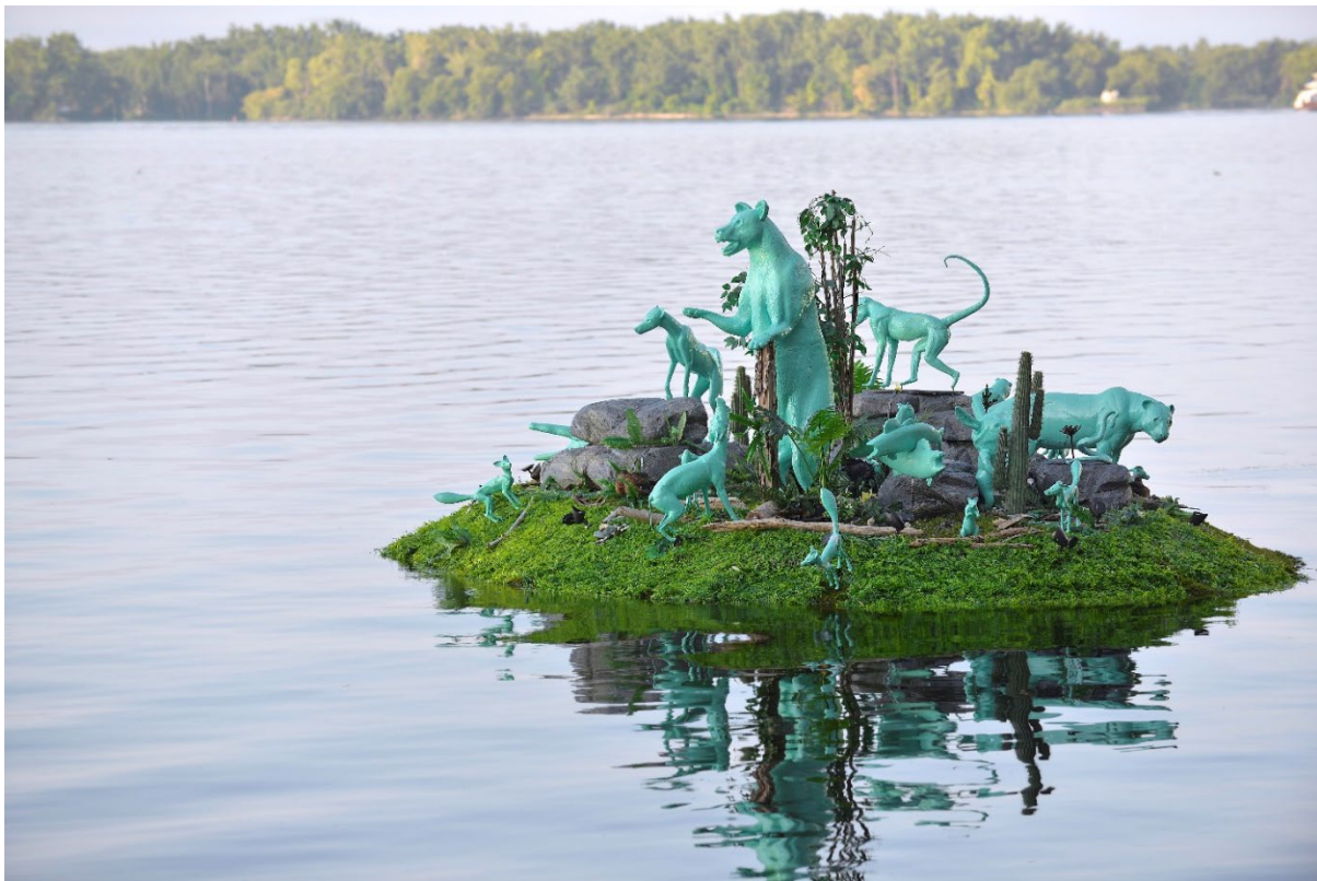
Demers-Mesnard, Happy Castaways , 2022