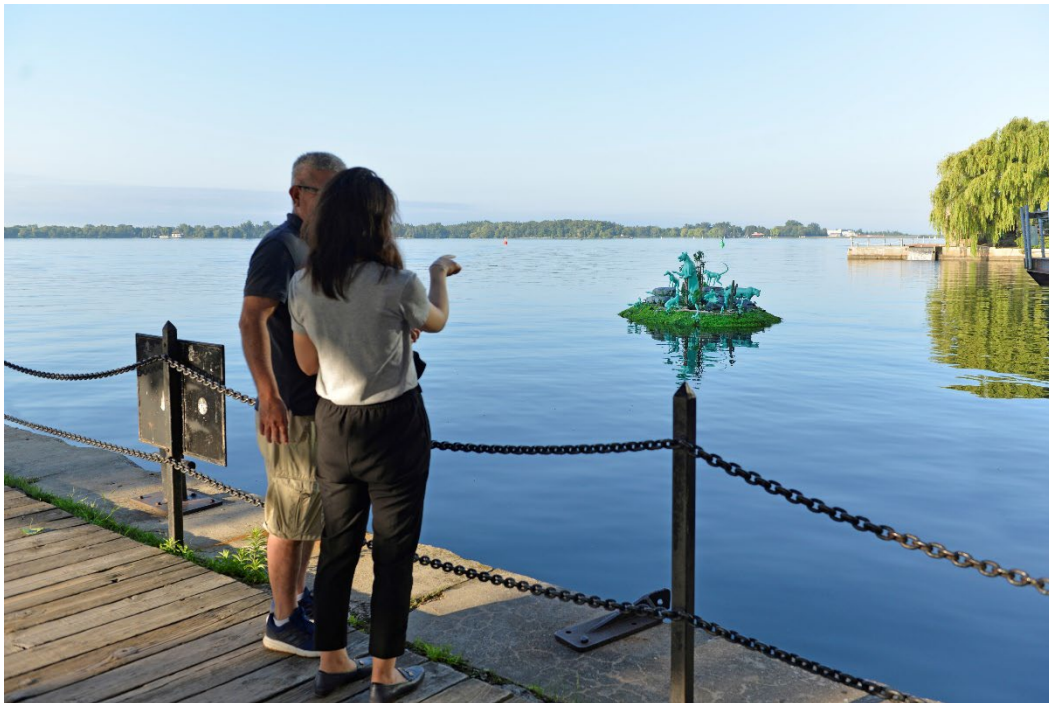
Demers-Mesnard, Happy Castaways , 2022