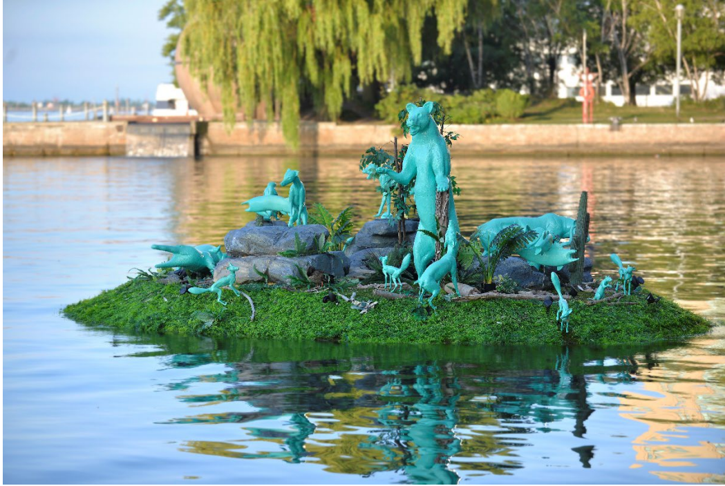
Demers-Mesnard, Happy Castaways , 2022