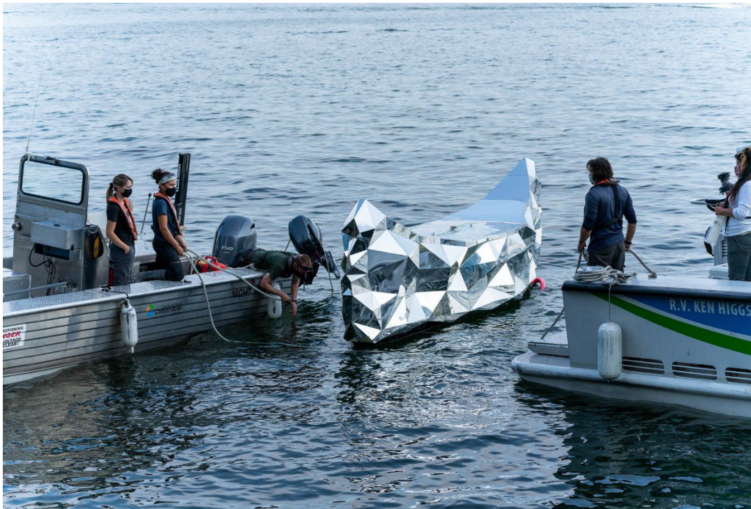
Installing The Peacemaker's Canoe