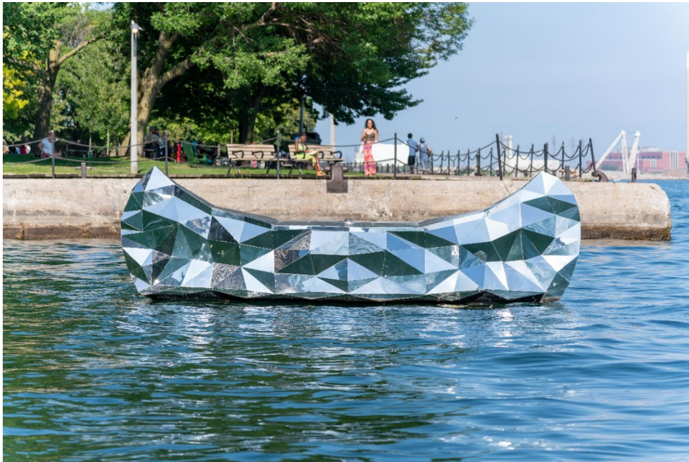
Jay Havens, The Peacemaker's Canoe , 2020