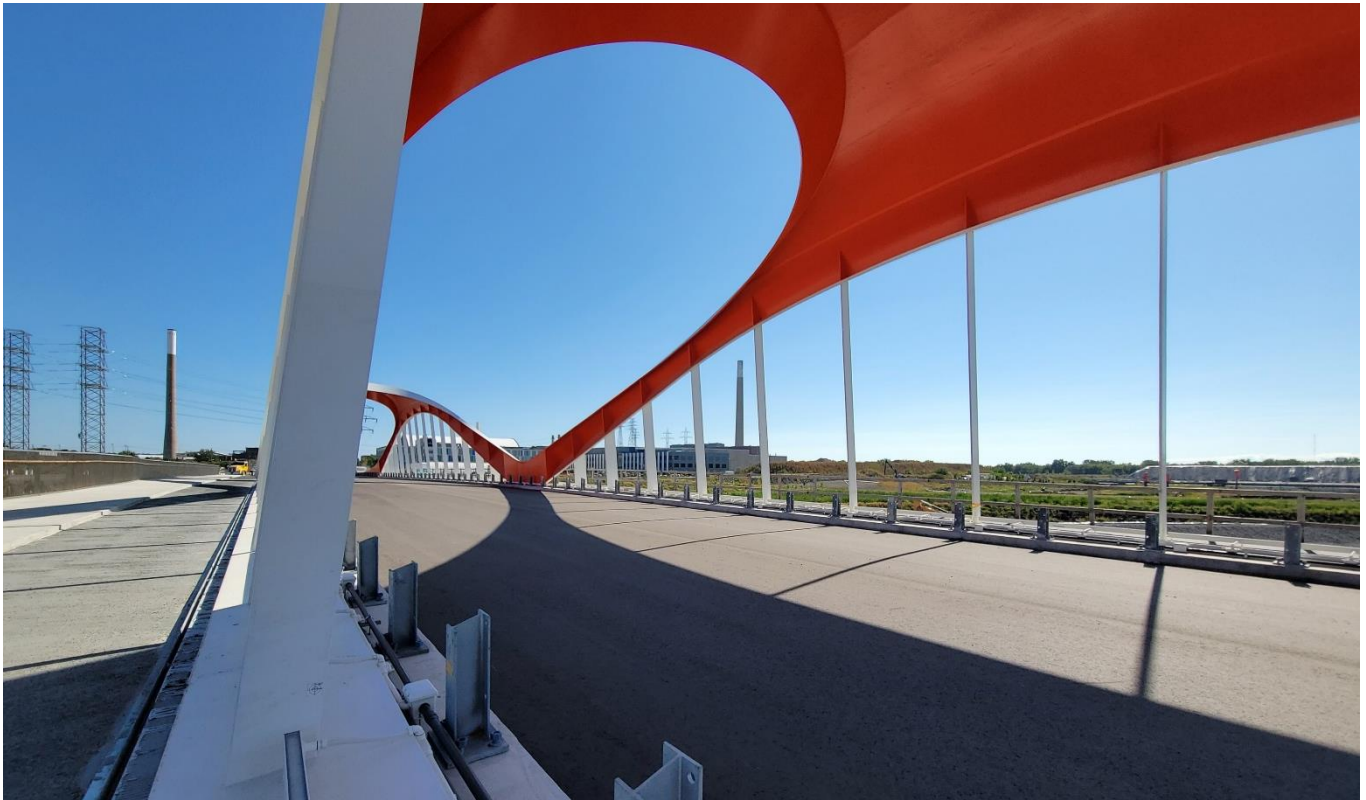
Above: The Commissioners Street Bridge has been paved.