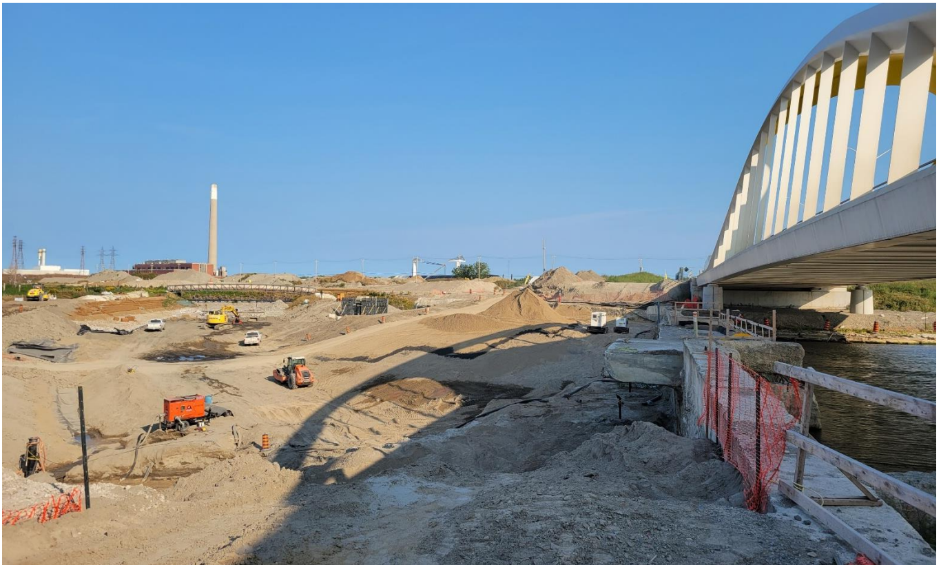
Above: excavation of the 'west plug', near the Cherry Street south bridge.