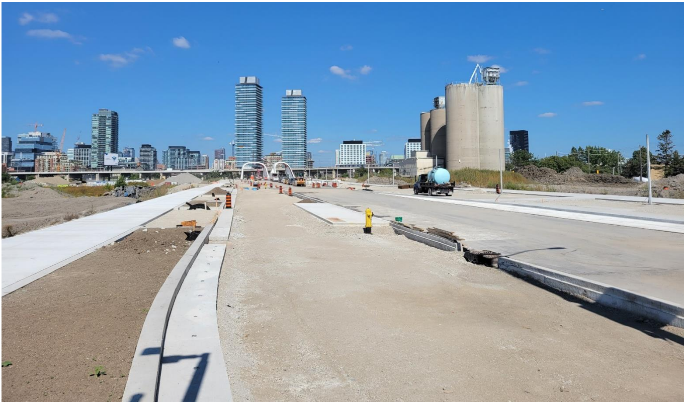
Above: Sidewalks, curbs, multi-use trail, and the road on the new alignment of Cherry Street.