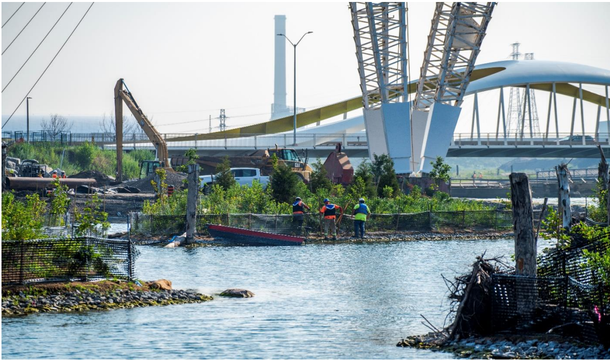
Above: Planting the islands in canoe cove.