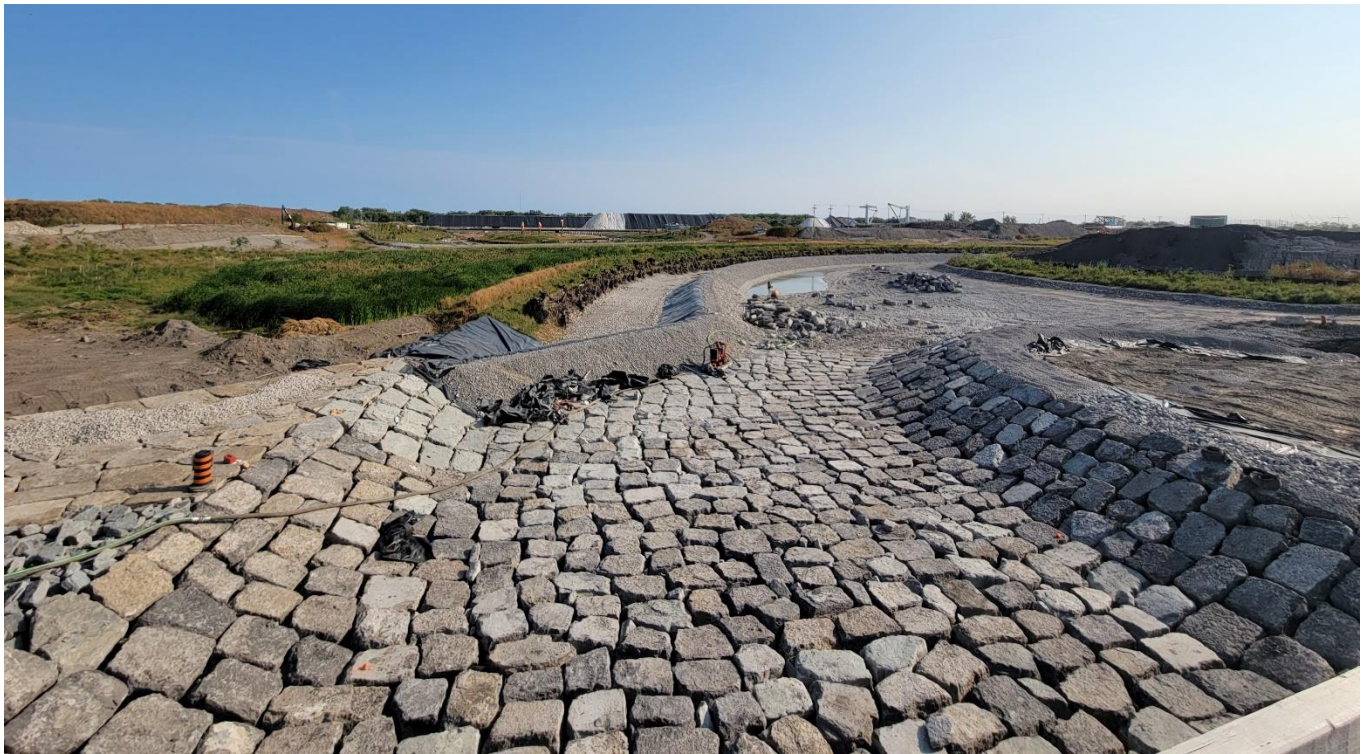
Above: Armour stone lining the riverbed south of the Commissioners Street bridge.