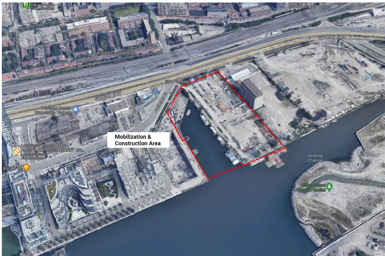
Figure 1: Location of mobilization and construction

Area within and surrounding the Parliament Slip spanning from 3 Parliament Street east to 333 Lake Shore Boulevard East and south to the waterfront.