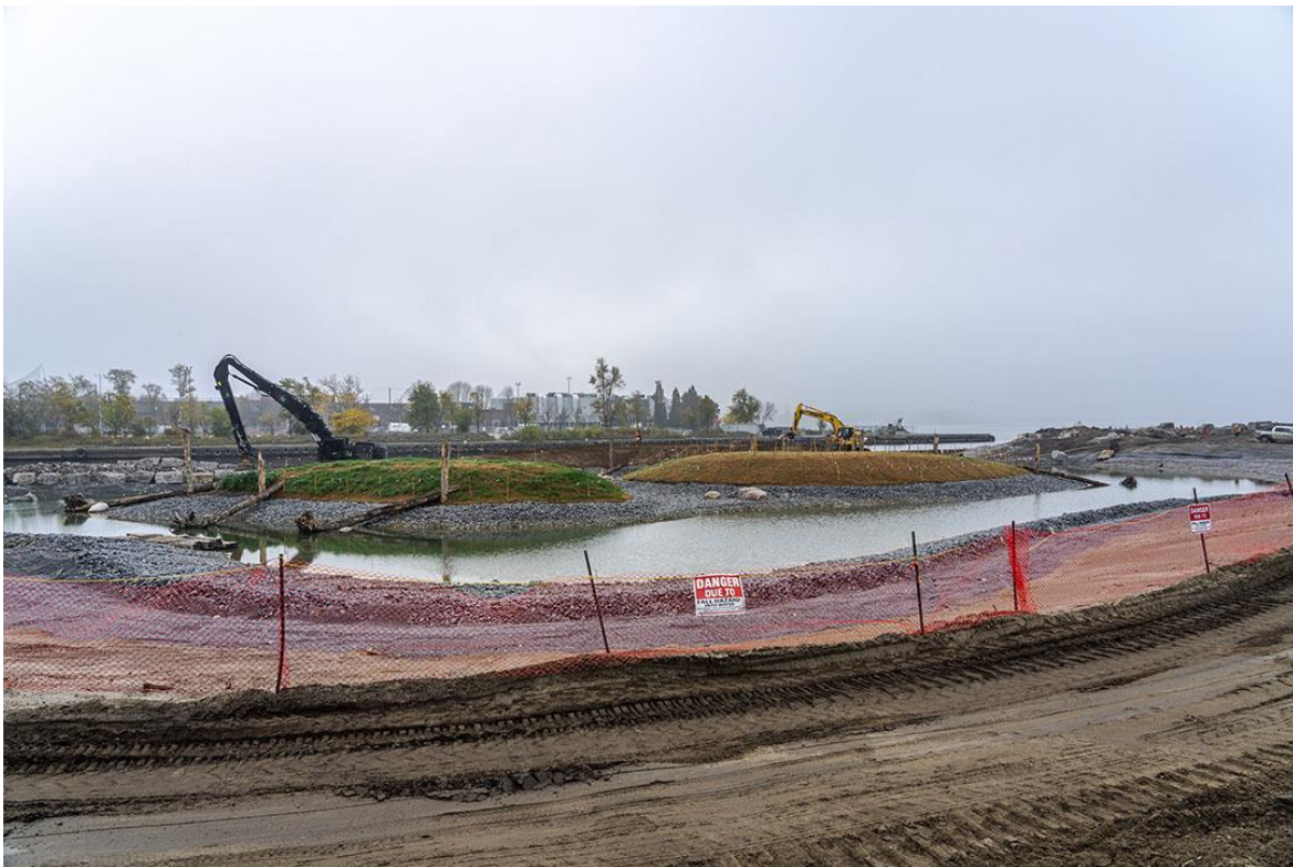
Above: The islands in Canoe Cove.