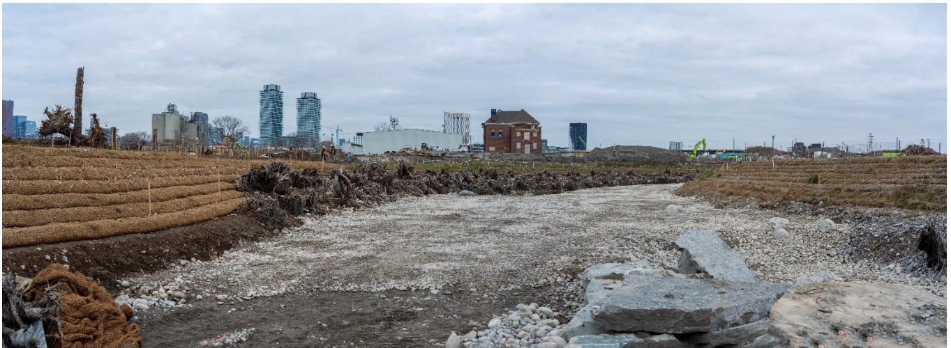
Above: Looking northeast along the central river valley. This is approximately the westernmost section of the completed riverbed. Construction will continue from this point west and connect with the Polson Slip.